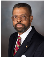
Senator Boris Miles

6117 Broadway St, Suite 122 Pearland, TX 77581 281-485-9800