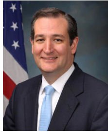
SENATOR TED CRUZ

5300 Memorial Dr, Ste 980 Houston, TX 77007 713-572-3337 cornyn.senate.gov/public/