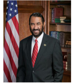
CONGRESSMAN AL GREEN

117 FM 59 Richmond, TX 77406 346-762-6600 nehls.house.gov