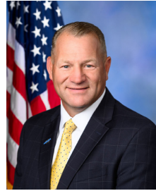
CONGRESSMAN TROY NEHLS

808 Travis St, Ste 1420 Houston, TX 77002 (713) 718-3057 cruz.senate.gov/