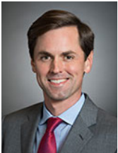
Senator Mayes Middleton