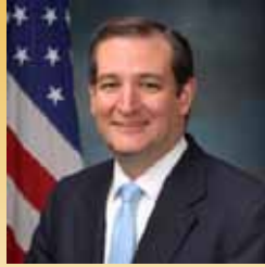
SENATOR TED CRUZ 404 Russell Senate Office Building Washington DC 20510 202-224-5922

5300 Memorial Dr, Ste 980 Houston, TX 77007 713-572-3337 cornyn.senate.gov/public/