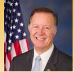
CONGRESSMAN RANDY WEBER 510 Cannon House Office Building Washington, DC 20515 202-225-2831

6117 Broadway St Pearland, TX 77581 281-485-4855 olson.house.gov/