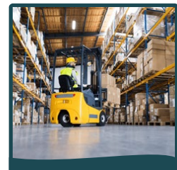
TRANSPORTATION & WAREHOUSING