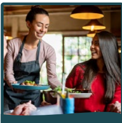
RETAIL, HOSPITALITY, & TOURISM