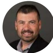
Jayme Praus Charbonneau Car Center