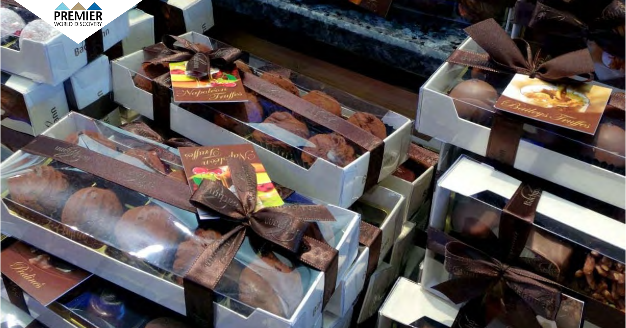
Day 8: Lucerne – Chocolates