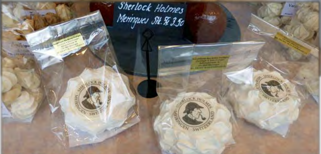
Day 7: Meiringen at Leisure – Meringues