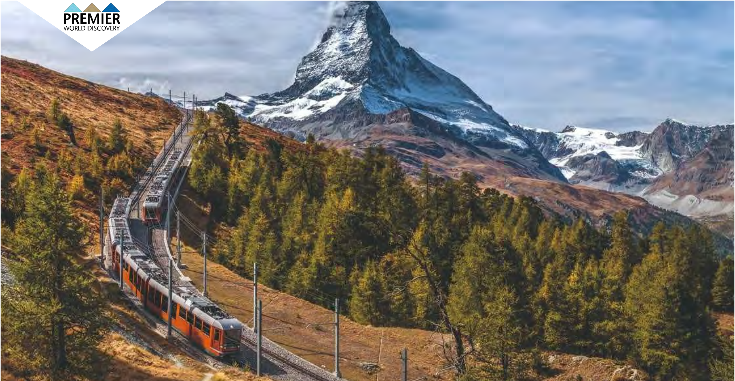
Day 6: Zermatt Optional - Cogwheel Railway to the Gornergrat (additional cost)