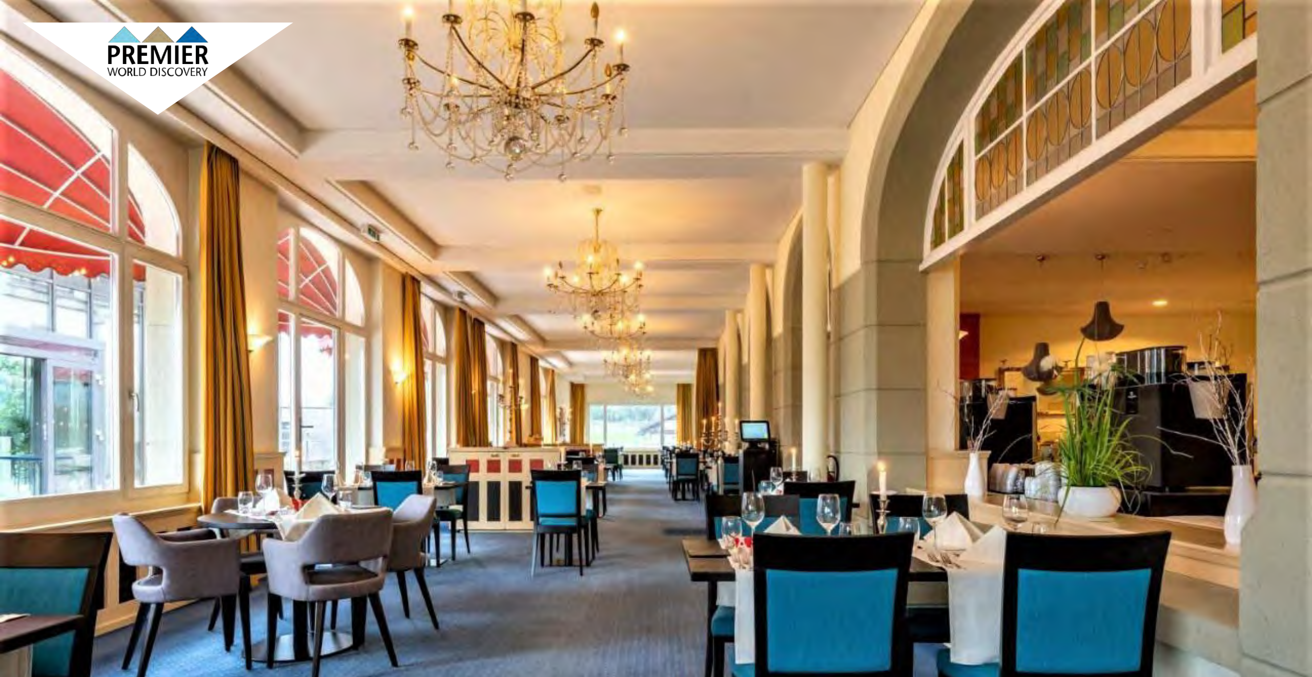
Accommodations – Arenas Resort Victoria-Lauberhorn, Wengen– 6 Nights