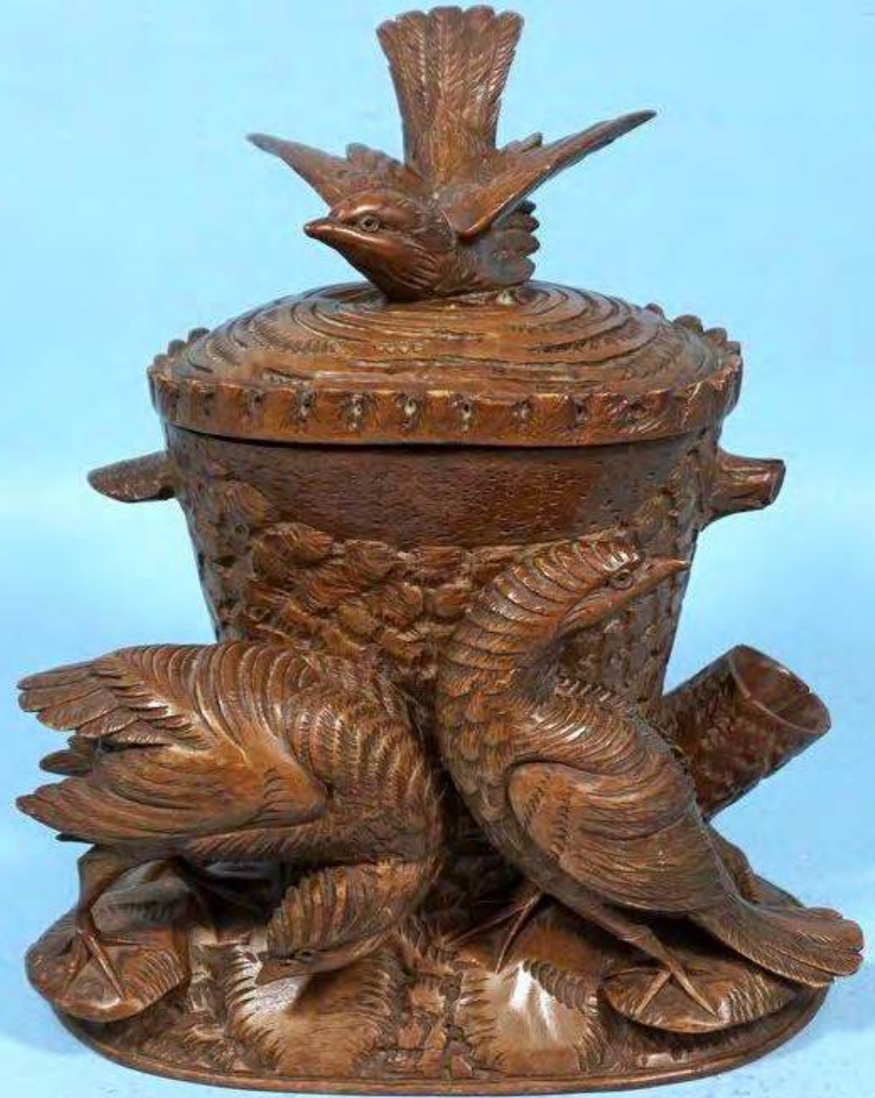
Day 8: Brienz – Wood Carving Shop