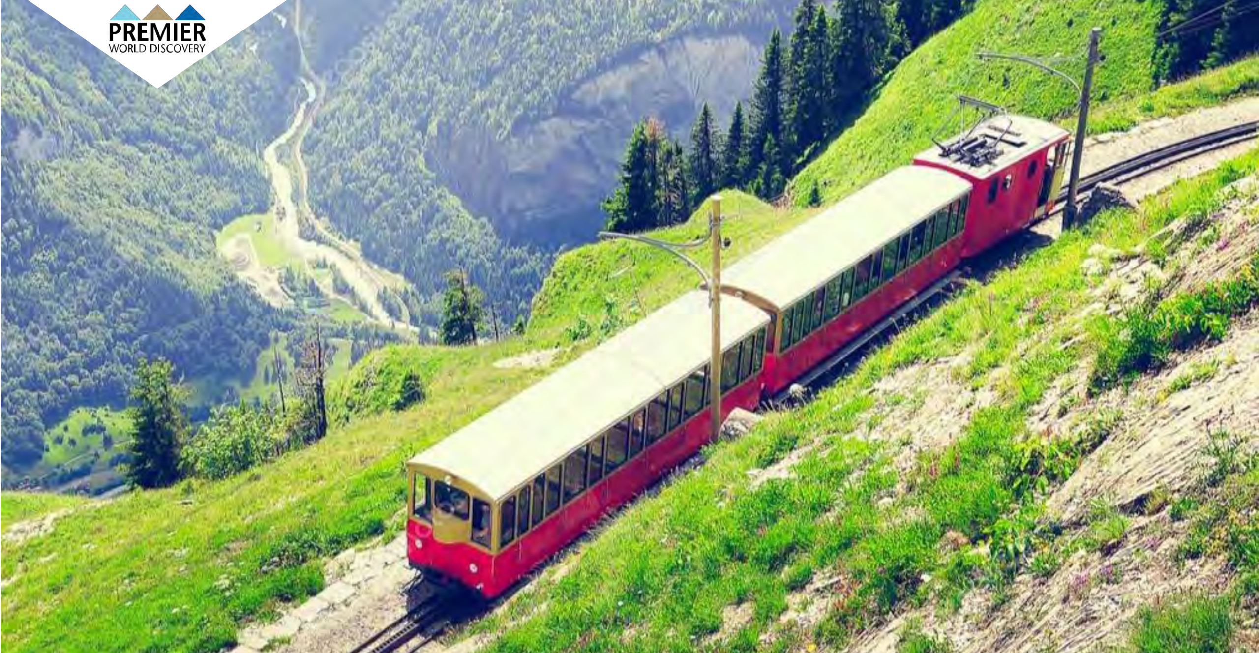
Day 5: Wilderswil - Vintage Cog Railway up to Schynige Platte