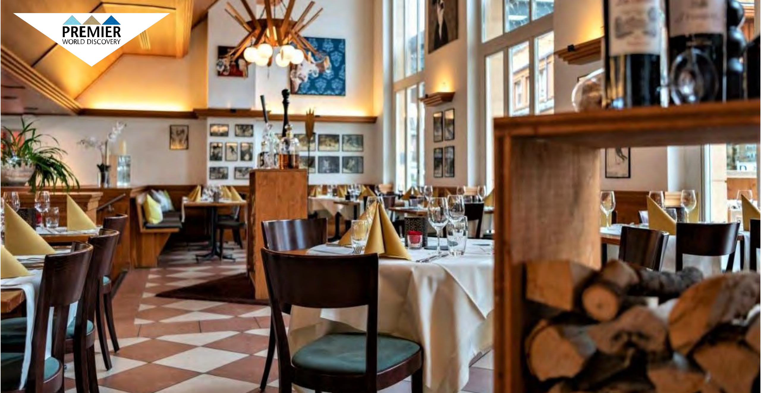
Accommodations – Arenas Resort Victoria-Lauberhorn, Wengen– 6 Nights