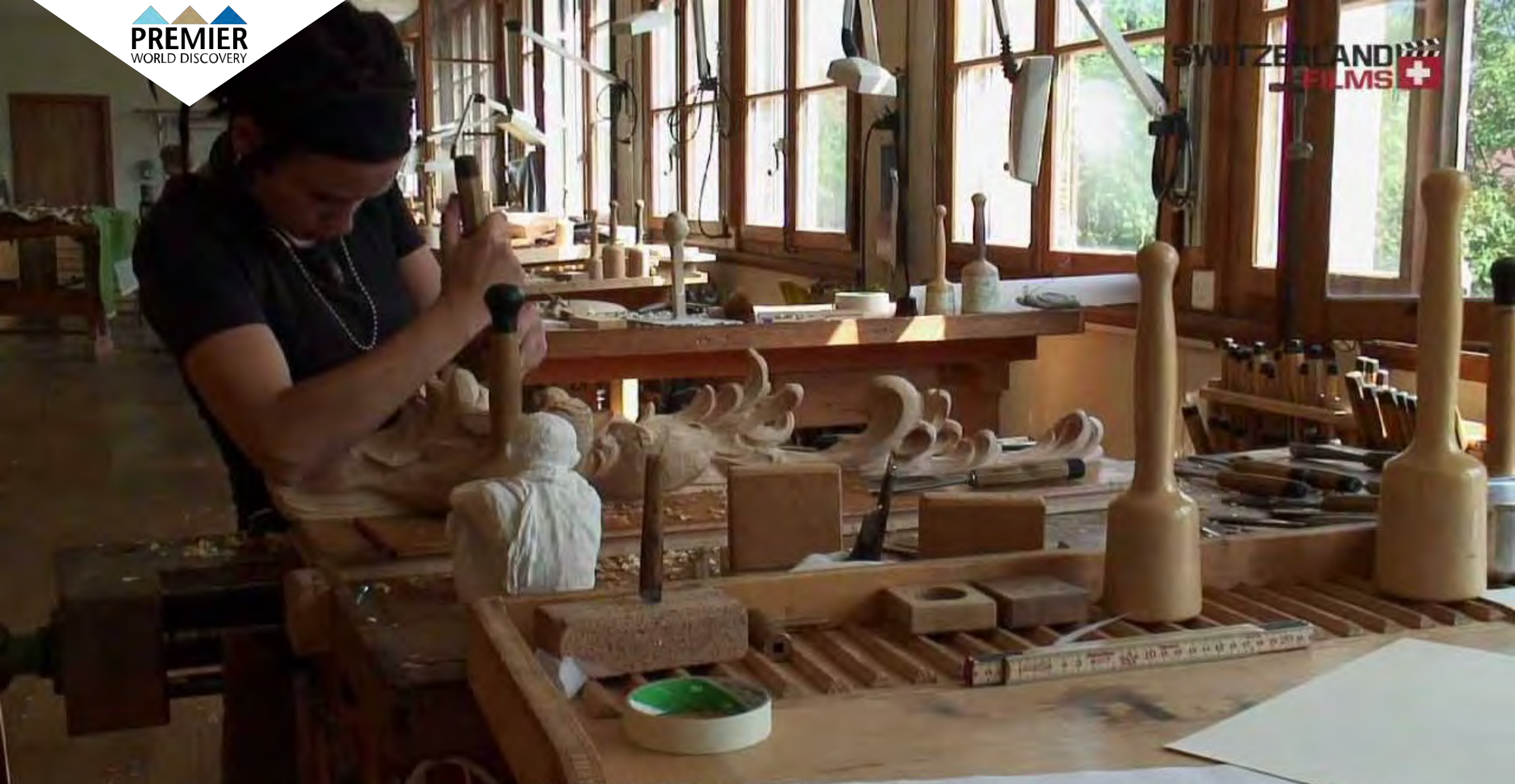
Day 8: Brienz – Wood Carving Shop