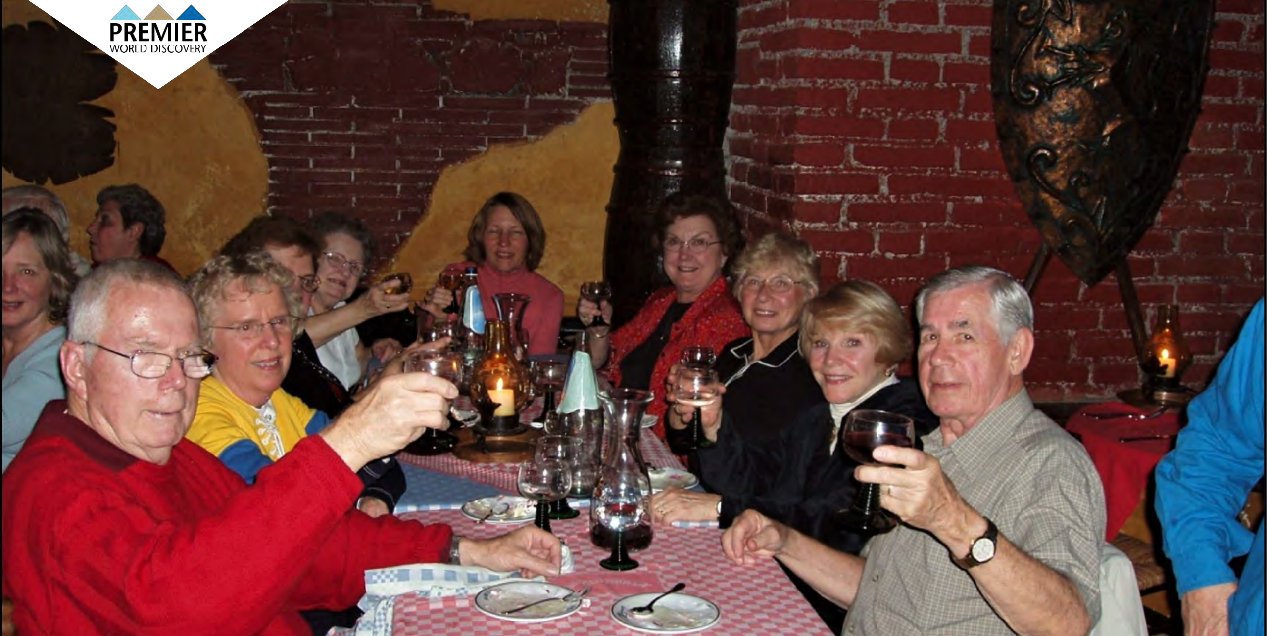
Day 8: Farewell Dinner