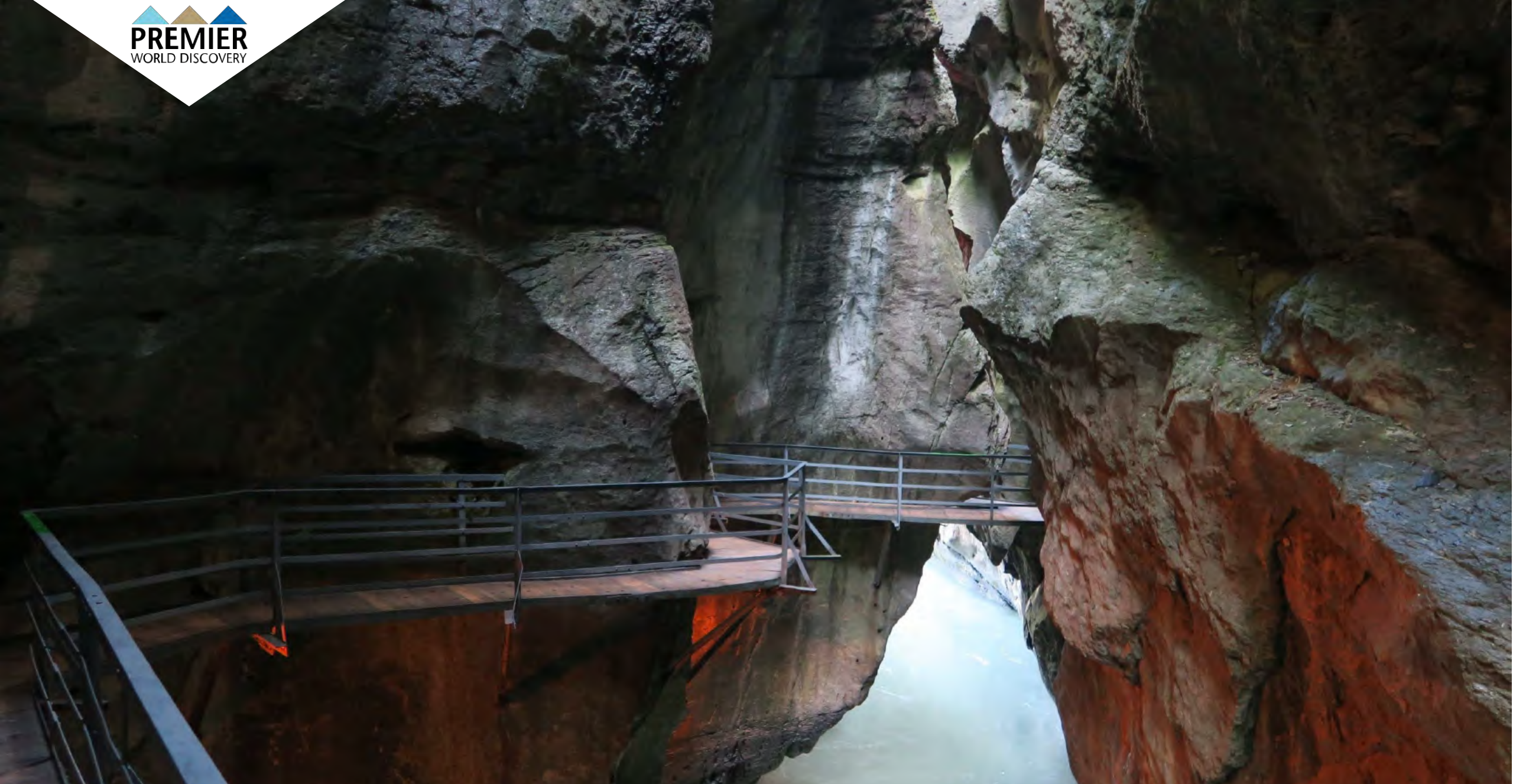
Day 7: Aare River Gorge