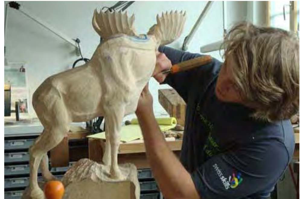
Day 8: Brienz – Wood Carving Shop