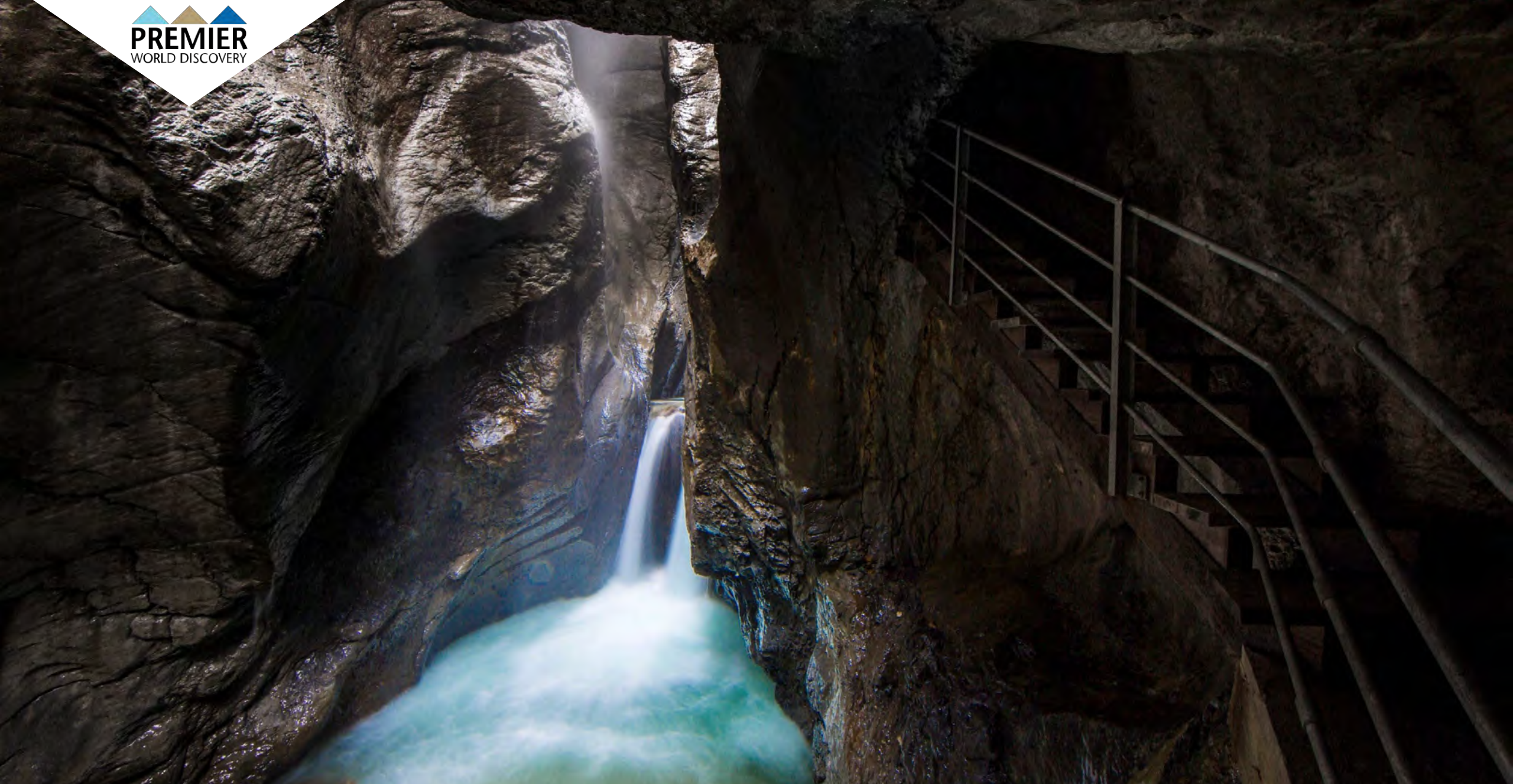
Day 7: Rosenlauri Glacier Gorge