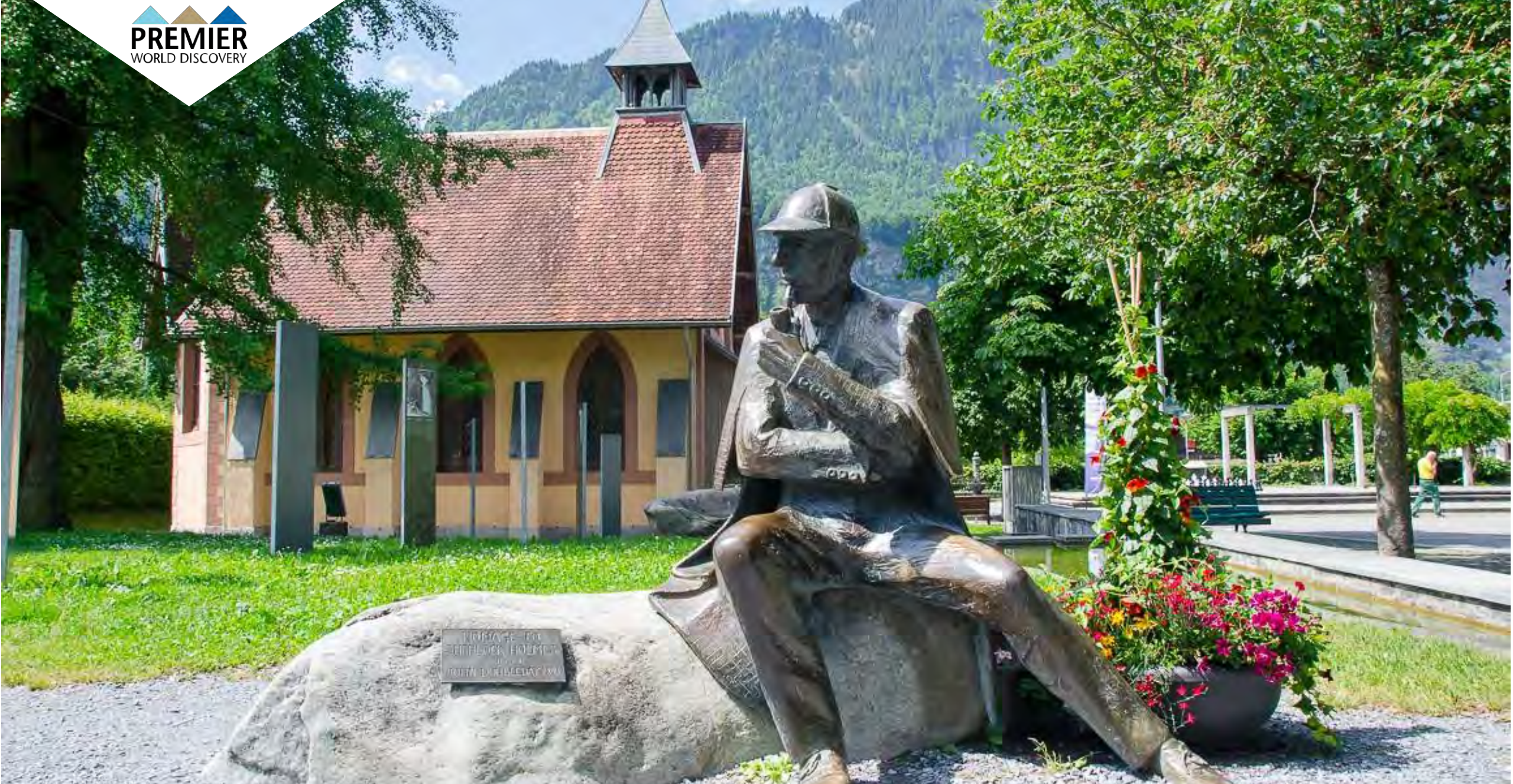
Day 7: Meiringen at Leisure – Sherlock Holmes Museum