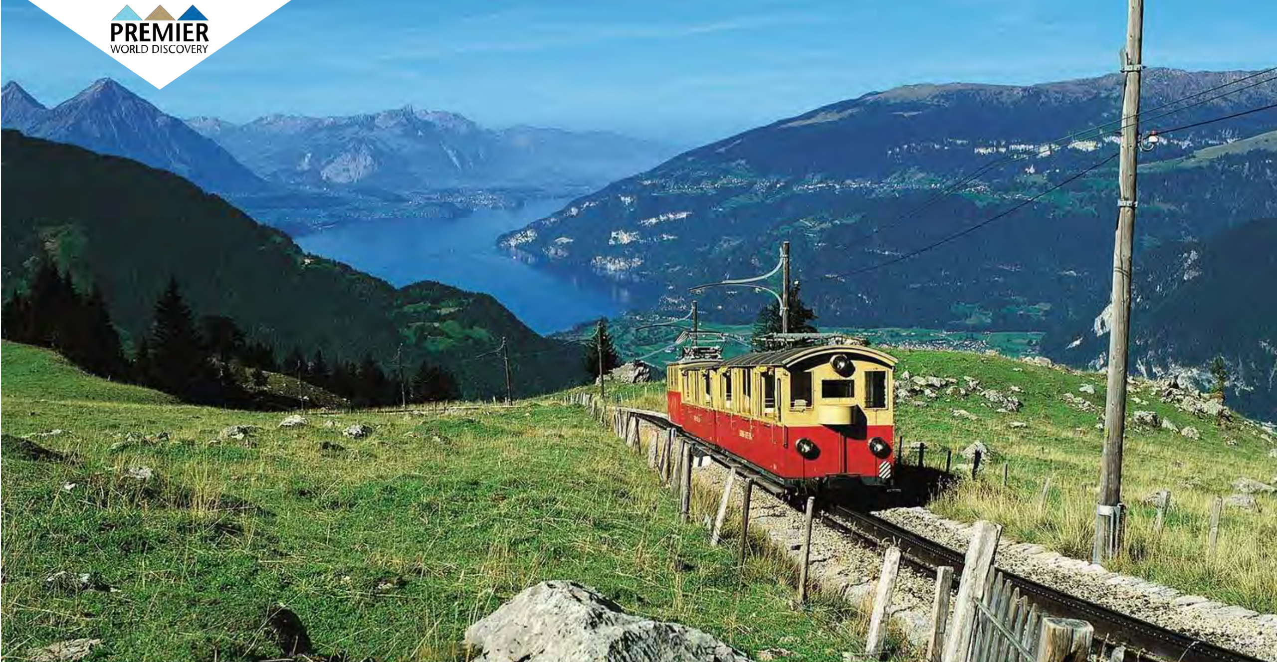
Day 5: Wilderswil - Vintage Cog Railway up to Schynige Platte