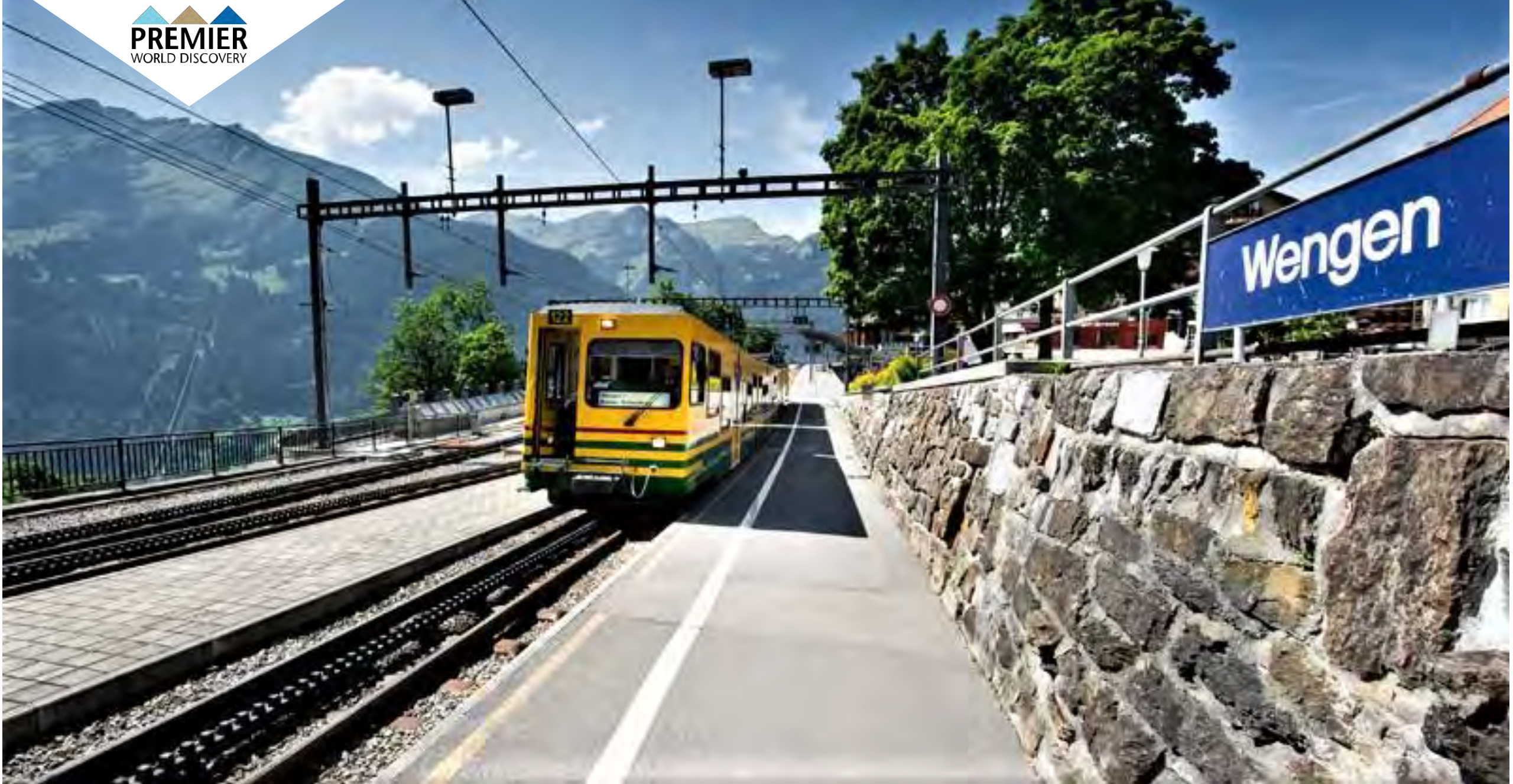
Day 2: Wengen