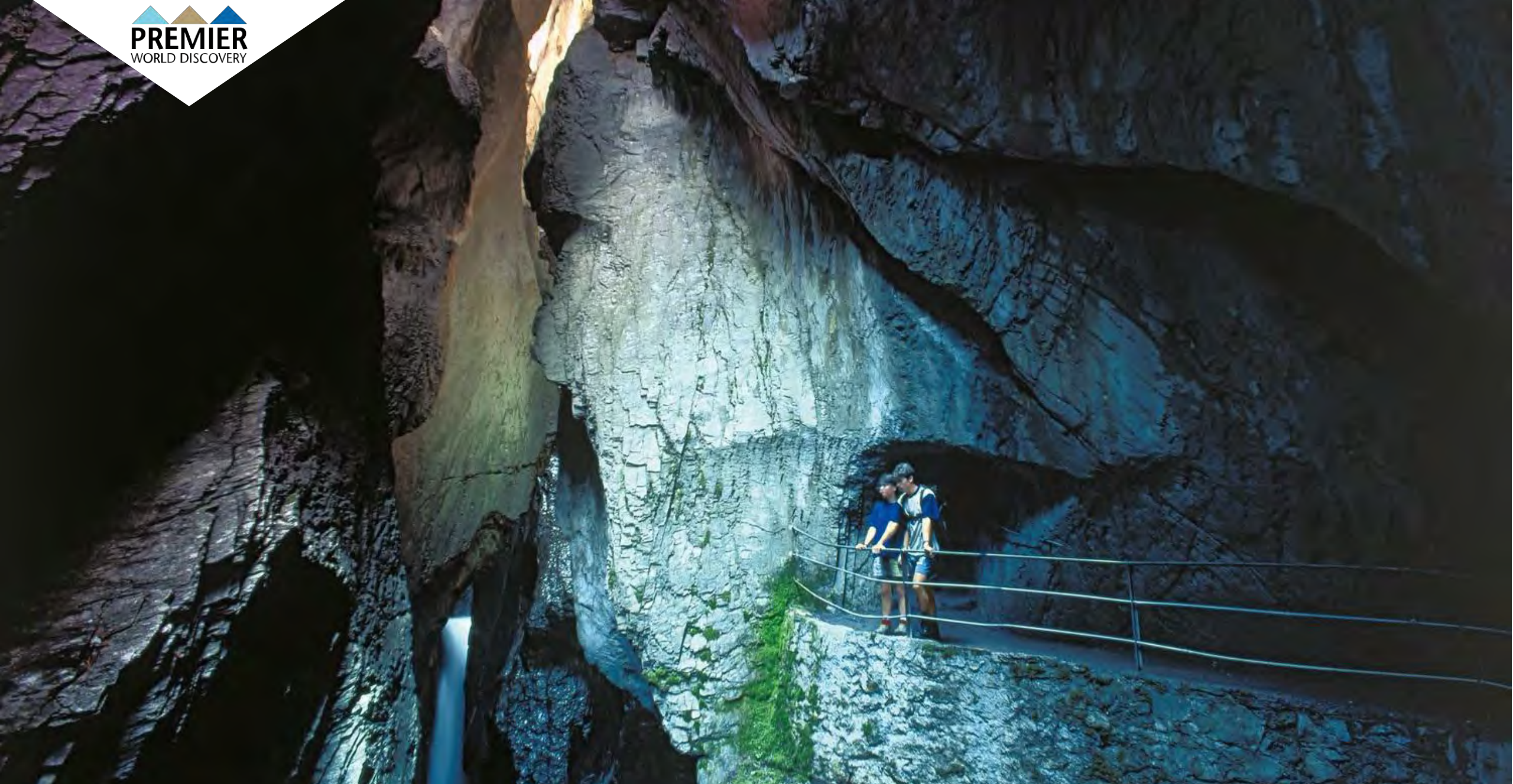
Day 7: Rosenlauri Glacier Gorge