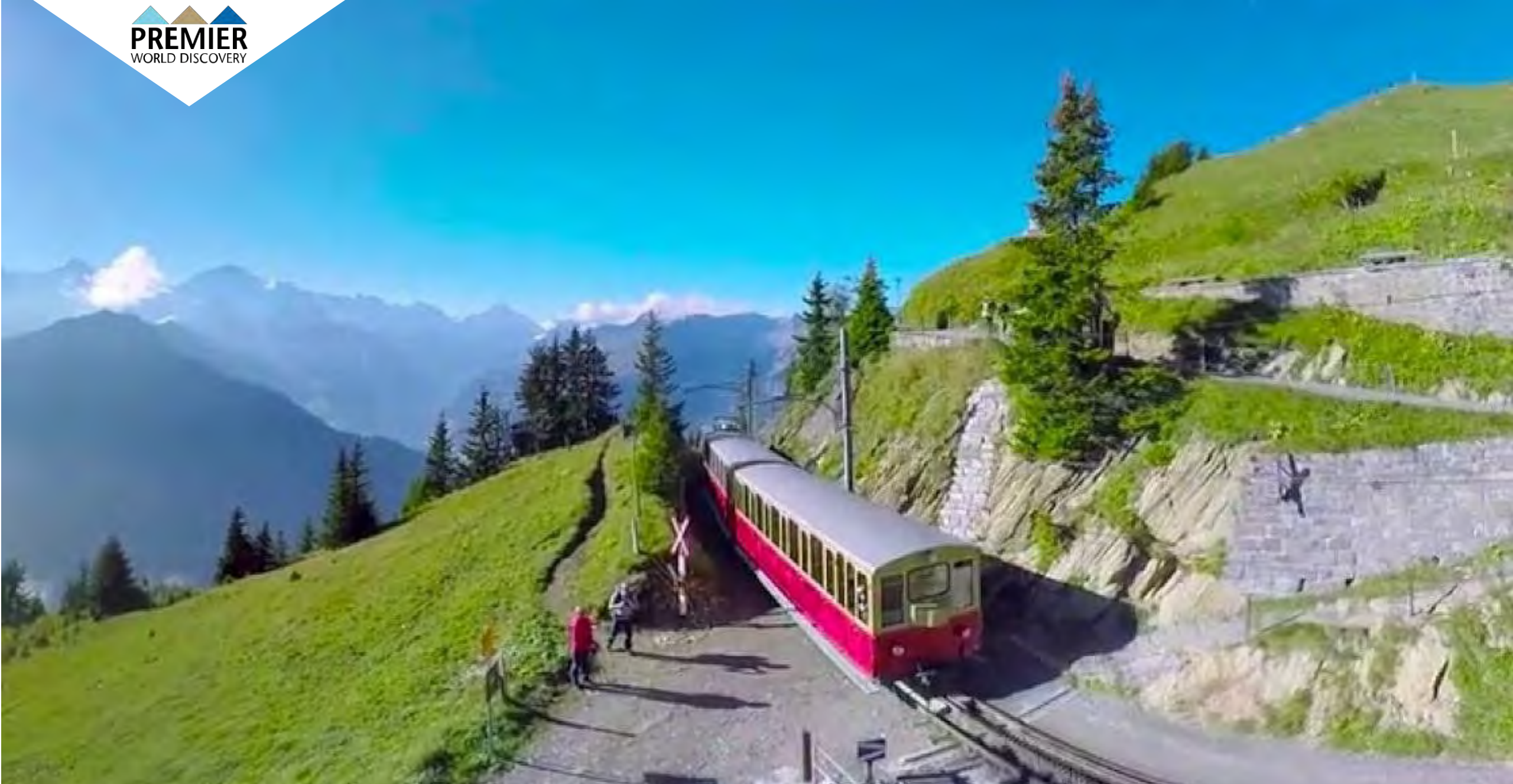
Day 5: Wilderswil - Vintage Cog Railway up to Schynige Platte