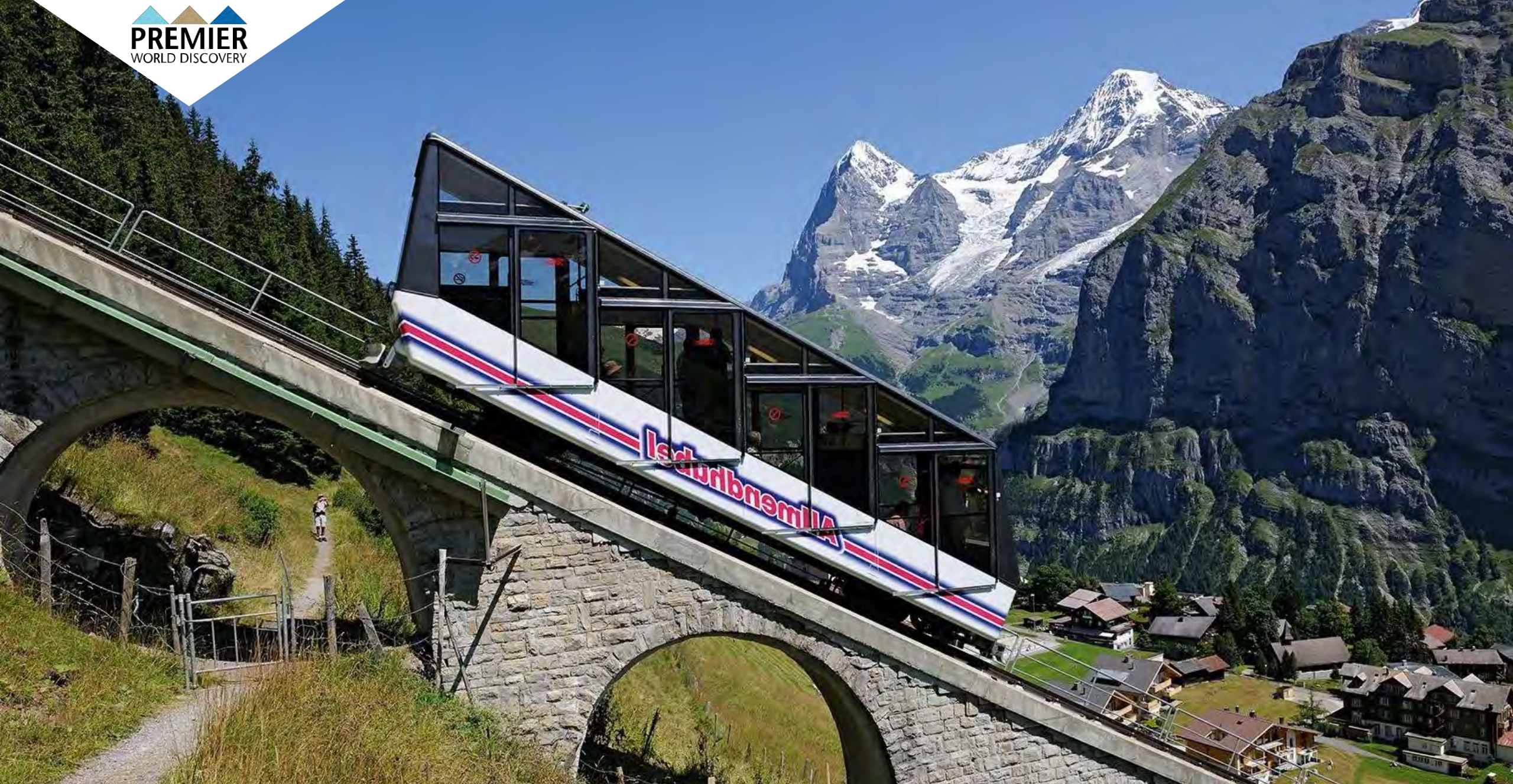
Day 3: Murren - funicular up to Allmendhubel