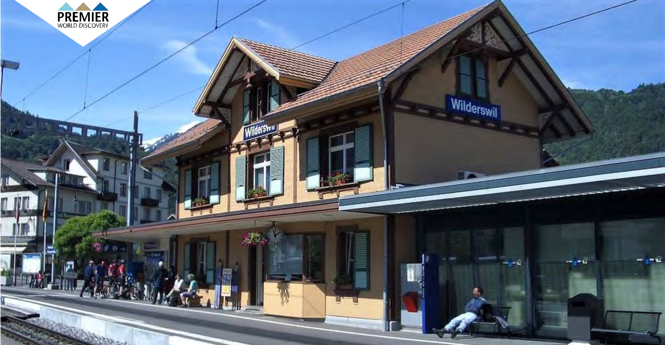
Day 5: Wilderswil Rail Station