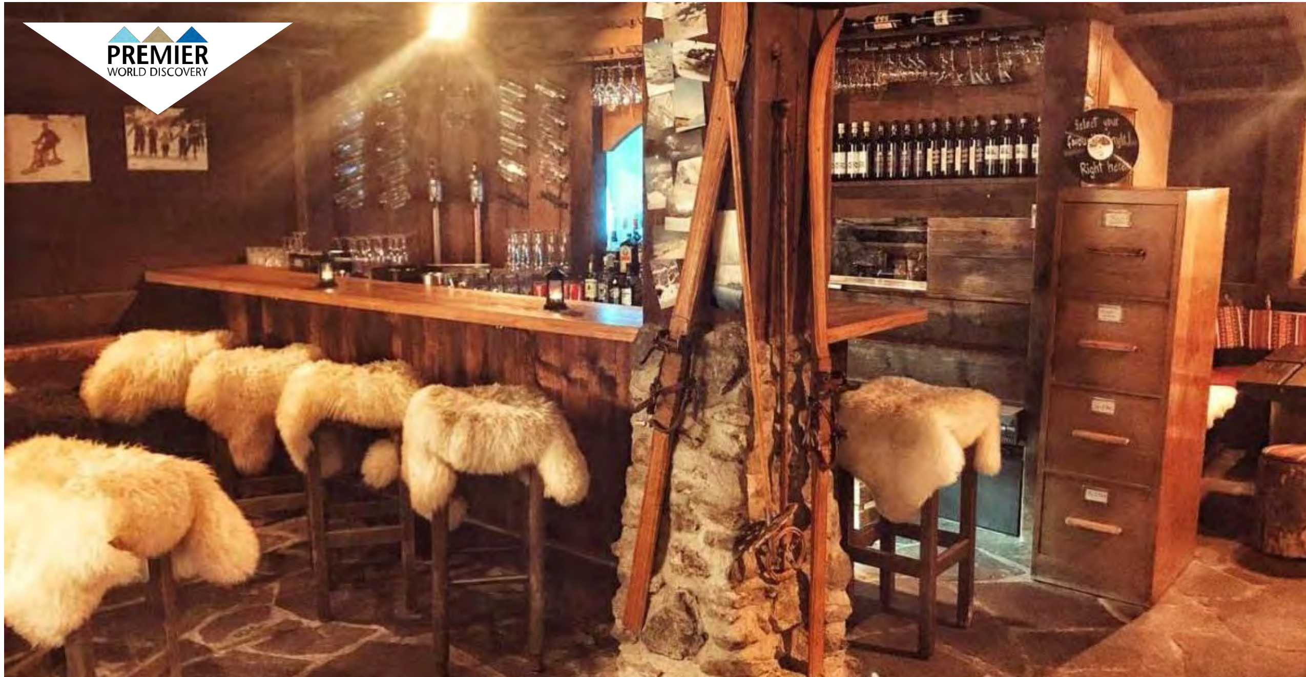
Accommodations – Silberhorn Hotel, Wengen– 6 Nights