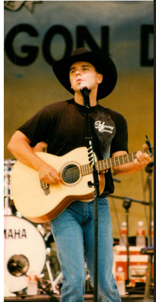
Kenny Chesney - SCG 1997

PLEASE NOTE: Event dates and details are subject to change without notice. Please check the Chamber calendar for the most current event details.