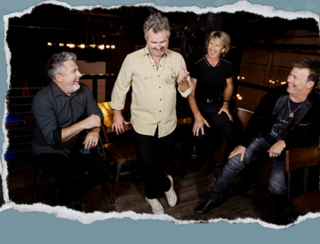
Lonestar Saturday, Sept. 3rd