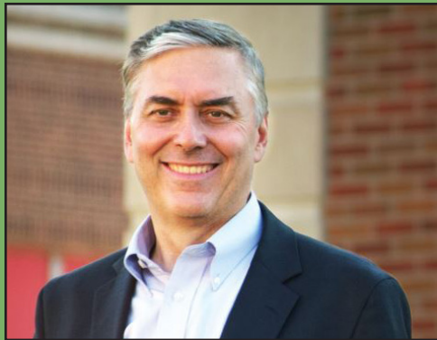
Mayor Rory Rowland City of Independence

Please register and plan to attend the July Membership Luncheon where Mayor Rory Rowland will be our guest speaker. Mayor Rowland will give an update on his first '100 Days' in office as mayor of the City of Independence.