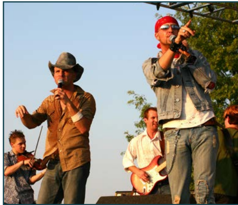
Locash Cowboys - SCG 2005