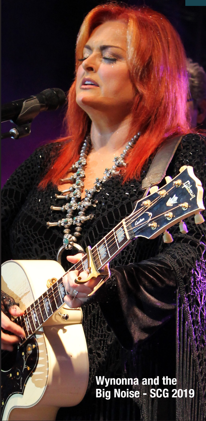
Wynonna and the Big Noise - SCG 2019