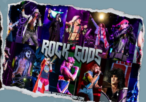
The Rock Gods Sunday, Sept. 4th

FOR MORE INFORMATION VISIT SANTACALIGON.COM