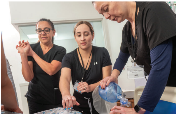
Obstetric simulation event, November 2024

AzHHA helps hospitals in our state implement maternal evidence-based practices and safety bundles. Guided by a team of experts, our goal is to end preventable maternal death and severe maternal morbidity.