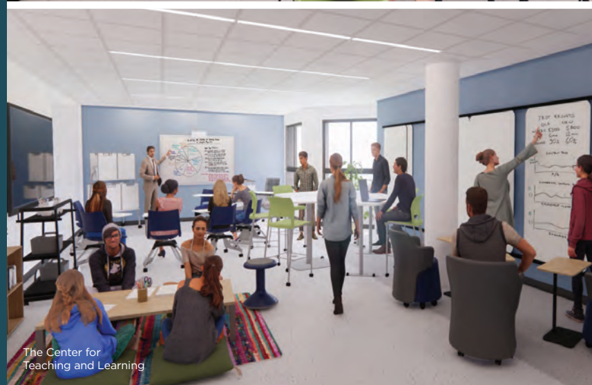
The Center for Teaching and Learning