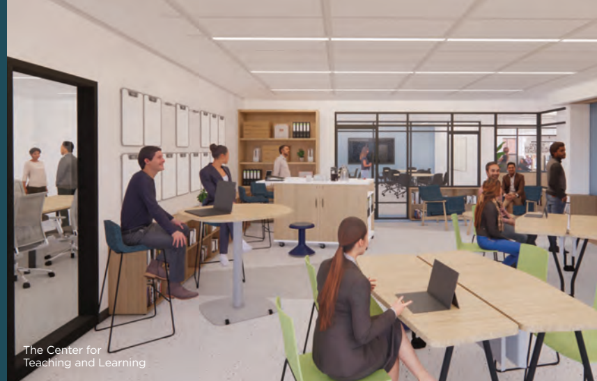
The Center for Teaching and Learning