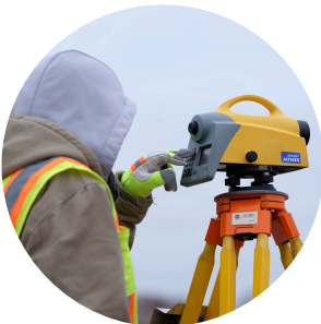
SURVEY & MAPS