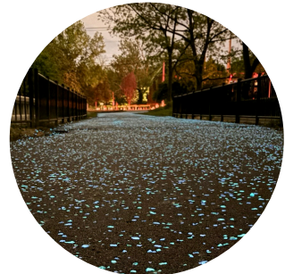
PARKS & TRAILS