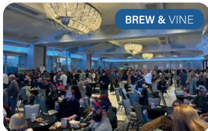
BREW & VINE