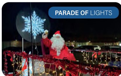
PARADE OF LIGHTS