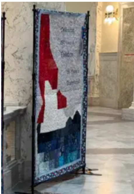
Below left: The quilt on display in the Idaho State Capitol rotunda. Photos provided

an embroidery hoop bigger than I had) to save the day. The words were embroidered onto the quilt top, then off to the longarm and then to binding.