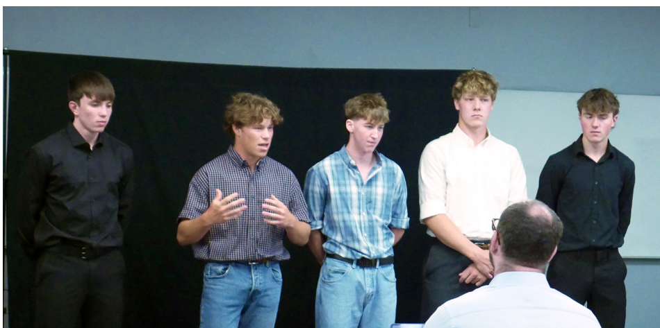
A team from Marshalltown High School in Iowa presented on the Granger Laws and the Grange at National History Day on June 16.