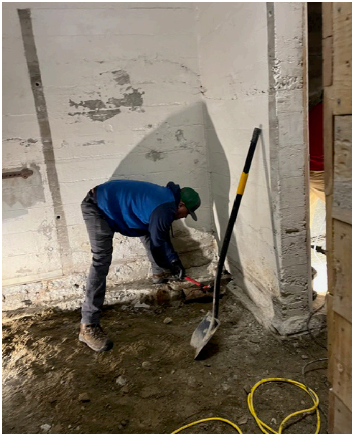
The first phase of the renovation includes repairs and updates to the basement of the Grange Hall, including updating a 75-year old sewer line and modernizing and making the restrooms accessible.

Learn more about Manson Grange's updates and service to the community at mansongrange.com .