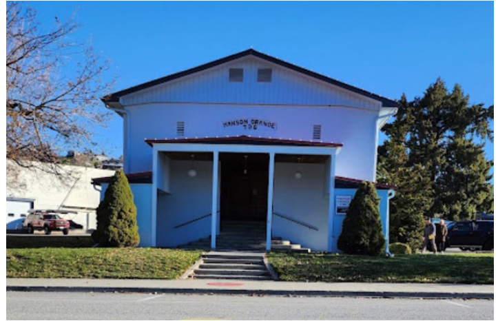
Manson Grange in Manson, Washington, has started its 7-step renovation project, so that it can continue supporting and serving the community for generations to come.