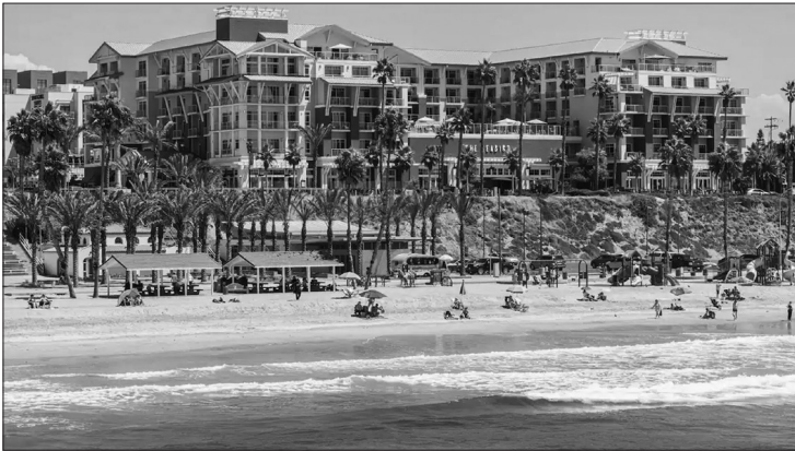
The 2025 Angle Midwest component meeting will be held at the Seabird Resort, Oceanside, California from January 31st – February 5th.