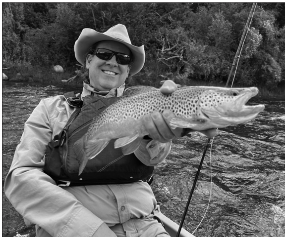
Our President with his catch in Vail!.