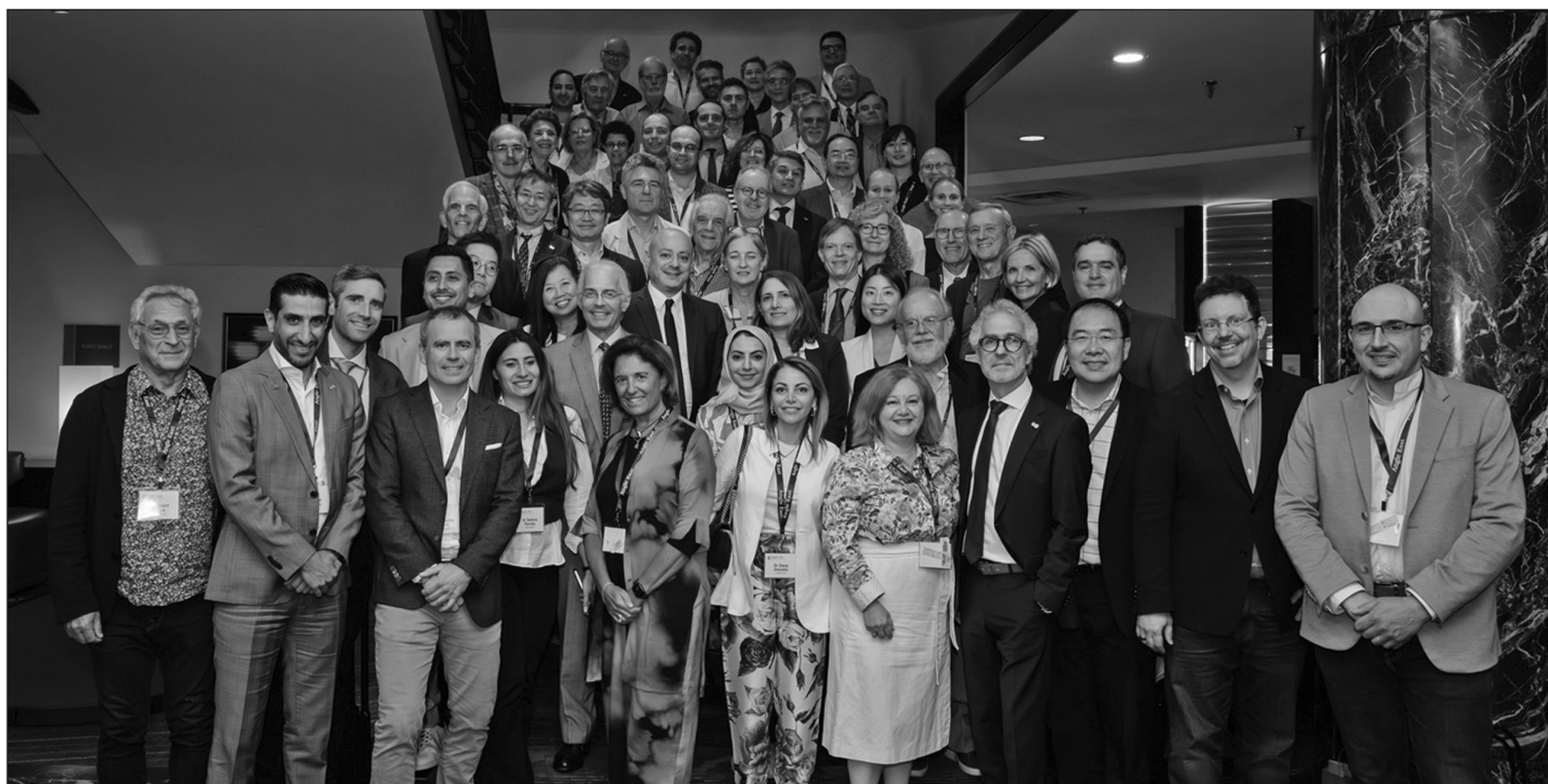
Angle-East members, guests and affiliate at the Hyatt Regency, Boston MA.

We had also the pleasure of having some residents from local orthodontic programs joining us for some of the scientific sessions and social events, so they could learn more about what the Angle Society is all about. ■