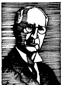
Edward H. Angle