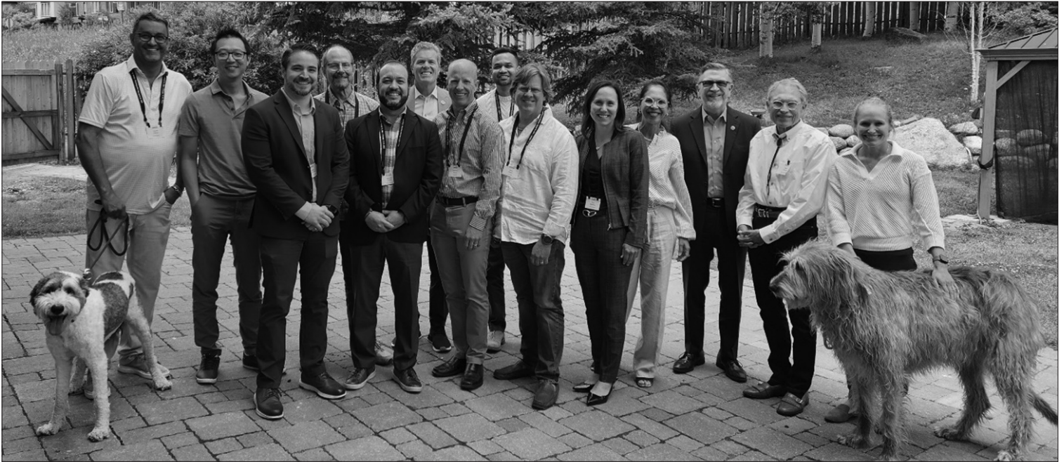
Southwest Component held our annual meeting in Vail, CO.