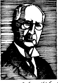
Edward H. Angle