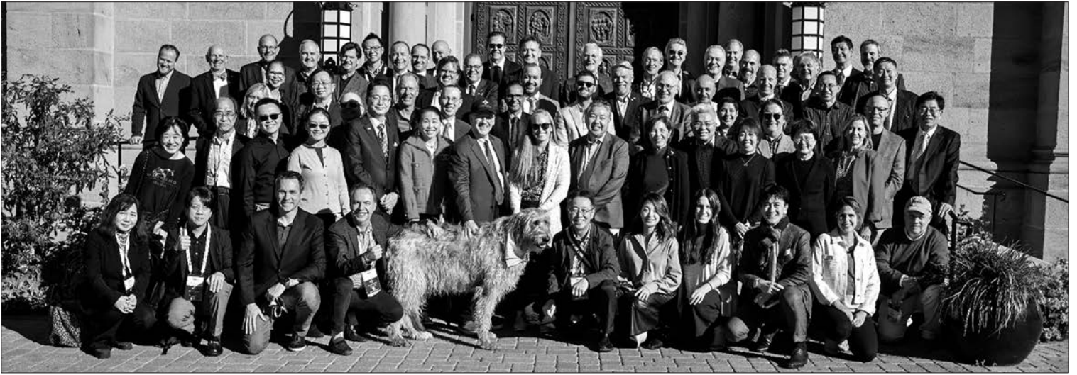
45th Biennial Group Photo.