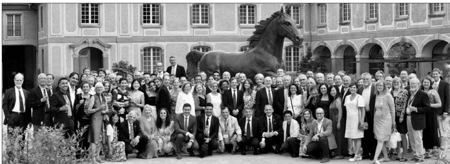
Angle-East members, guests, affiliates and their families at Hôtel Les Haras.