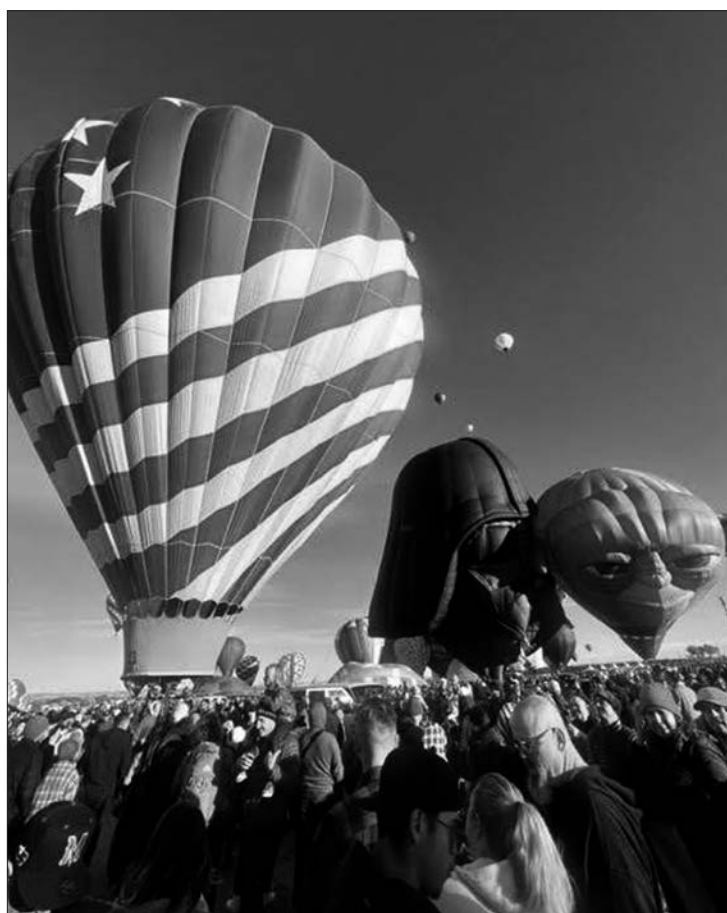
Thank you Angle Southwest for a wonderful experience.