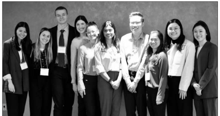
We had a talented group of residents attend from the University of British Columbia.