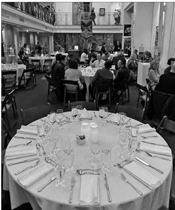
Our Friday night social event included a dinner at the Bill Reid Gallery displaying First Nation art work.