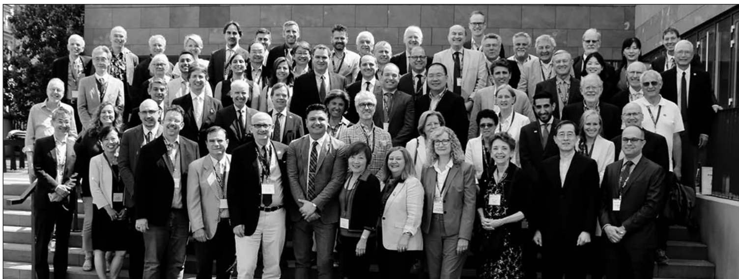
Angle-East members, guests and affiliates at the Faculté de chirurgie dentaire de Strasbourg.