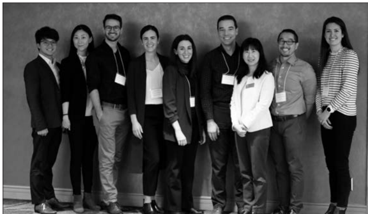
We had a diverse group of affiliate candidates and other guests in attendance seeking membership through a clinical or academic pathway.