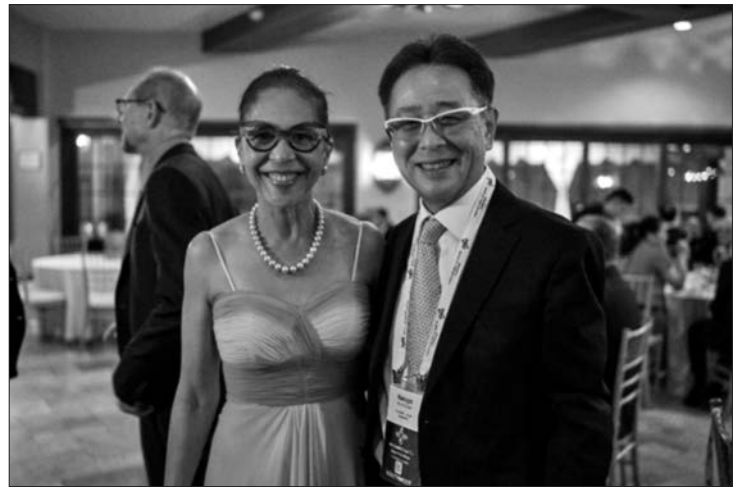
Celebrating at the Gala Dinner.