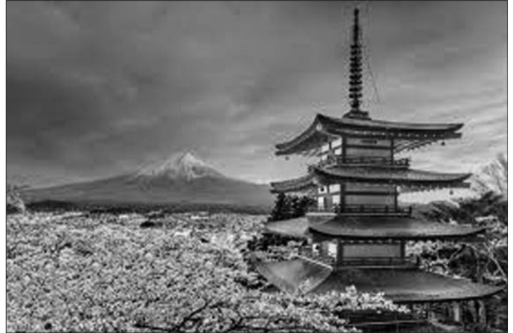
Cherry Blossom Season Japan.