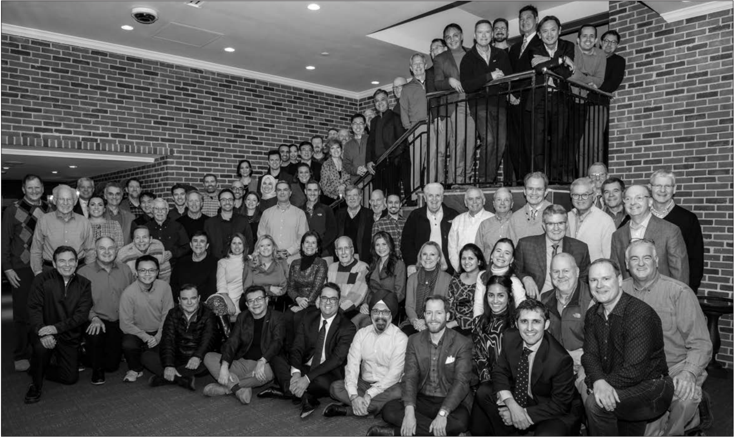
Angle Midwest 2023, Kohler, Wisconsin.