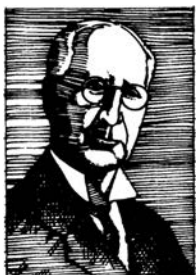
Edward H. Angle