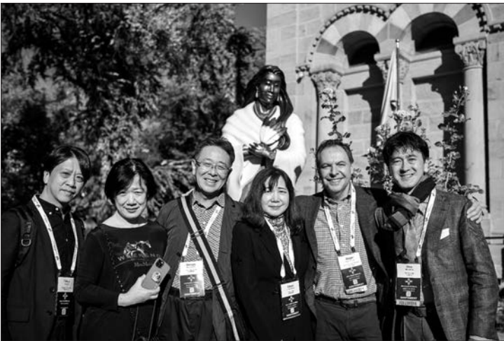
Beautiful Day in Santa Fe with our faithful At Large members.