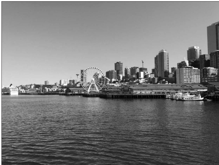
Our upcoming meeting will be held in beautiful Seattle, Washington