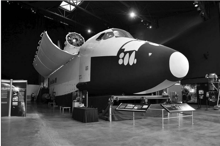
The Museum of Flight