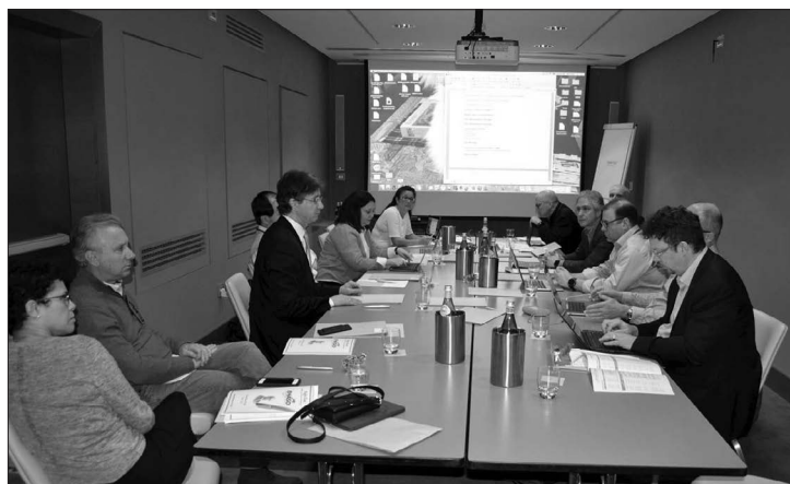
The Executive Committee at work in Milan, Italy 2018.