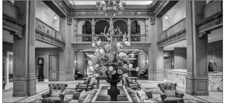
The elegant and grand Fairmont Olympic Hotel will be the site of our upcoming meeting.

Several NW Component Members will be making presentations including Dr. Donal Flanagan who will be giving a presentation titled "Expand your mind, Transplant your problems, Stuck on you" which will explore how he handled 3 challenging cases