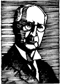
Edward H. Angle