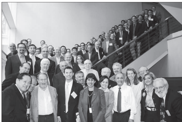
The Angle North Atlantic group in Barcelona, Spain.

It is truly humbling to be part of such a distinguished and knowledgeable group of academicians and clinicians, who not only have such passion for the specialty, but also celebrate life to its fullest. ■