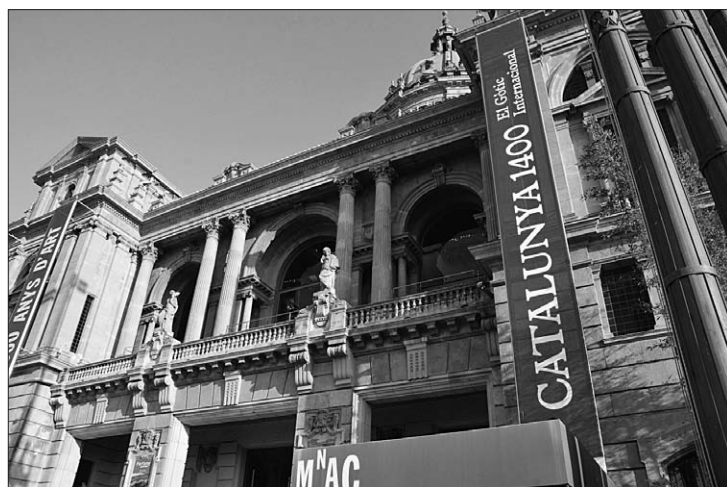
MNAC in Barcelona, Spain

meetings and received numerous accolades for their contributions in research, publications, and service.