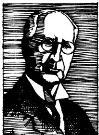
Edward H. Angle