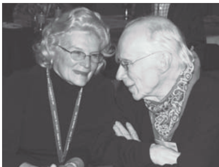
The Perfect Team