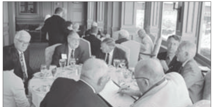
Angle Northern California Members and guests enjoying lunch at the Peninsula Golf and Country Club in San Mateo, California