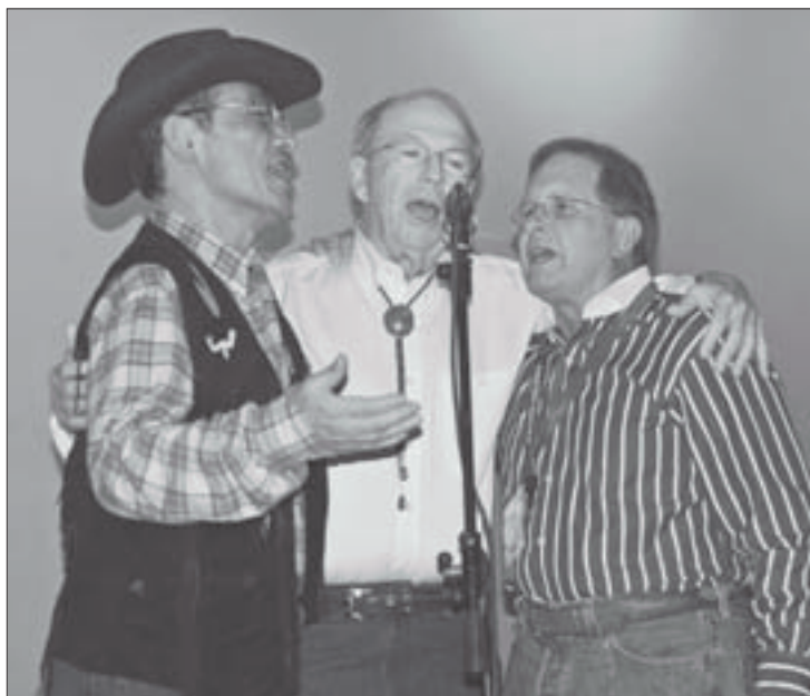
Japanese & Texas Cowboys