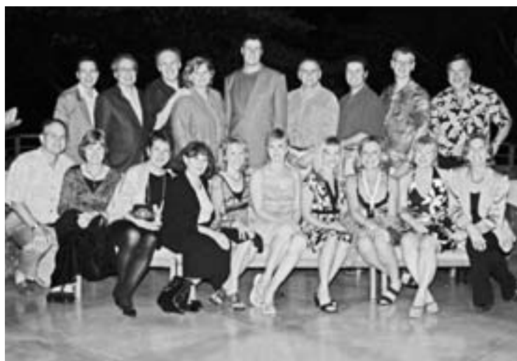
The Angle Midwest Board of Directors enjoying a night out in Hawaii.

For more information regarding the Angle Midwest, visit our web page at www. anglemidwest.org ■