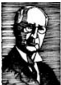
Edward H. Angle