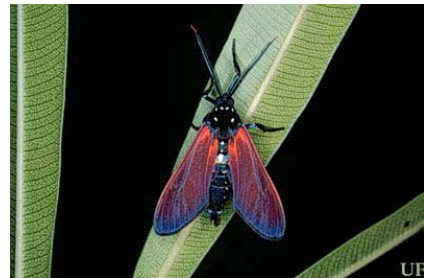
Empyreuma affinis (Lepidoptera, Arctiidae, Ctenuchinae)

For more that 20 years, our main research technique has been the electrophysiological recording of activity from the tympanic nerve of different moth species, and