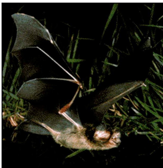
Pteronotus parnellii (Mormoopidae)