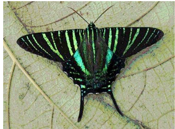
Uria boisduvalii (Lepidoptera, Uraniidae)

Our electrophysiological recordings lead us to propose