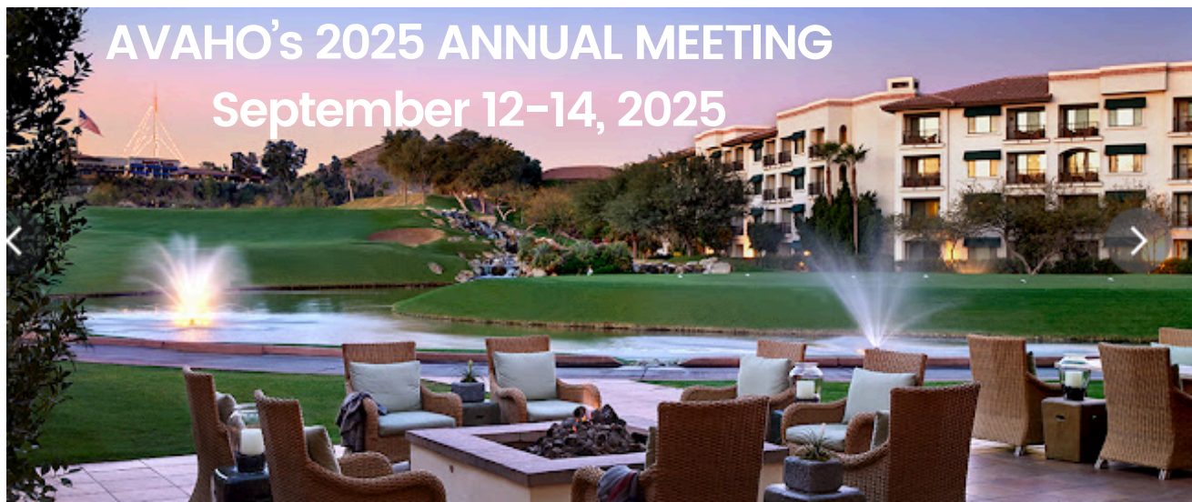
Arizona Grand Resort and Spa, Phoenix, AZ