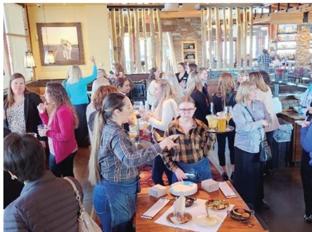
Networking at the March 28 WIB event at Lazy Dog Restaurant and Bar.