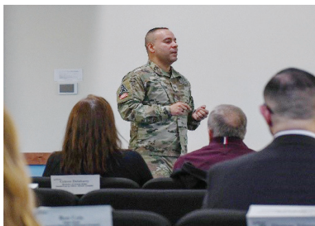
DEL-4 Commander Colonel Miguel Cruz DEL-4 addresses Defense Council Members.

Colonel Miguel Cruz, DEL-4 Commander, welcomed the council and provided a captivating overview of the DEL 4 mission which is to provide strategic and theater missile warning to the United States and our International Partners. DEL 4 operates three constellations of satellites and two types of ground-based radar systems. They are one of eight mission-oriented Deltas within the United States Space Force. DEL 4 is headquartered at