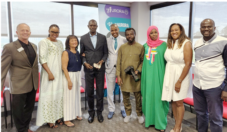
Welcoming new friends from Senegal.