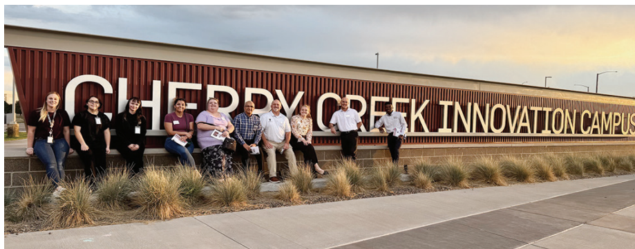
YPs at the Cherry Creek Innovation Campus