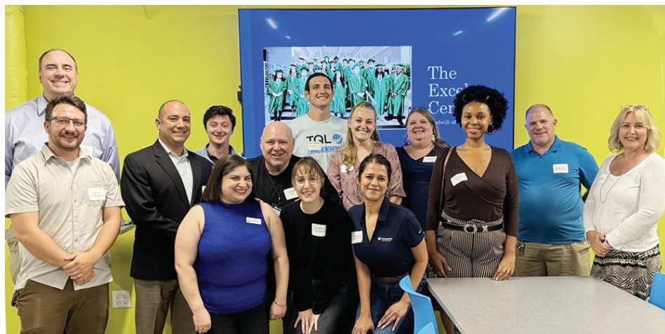
Chamber Young Professionals at The Excel Center

Go to excelcentercolorado.org to learn more about this powerful opportunity within our community.