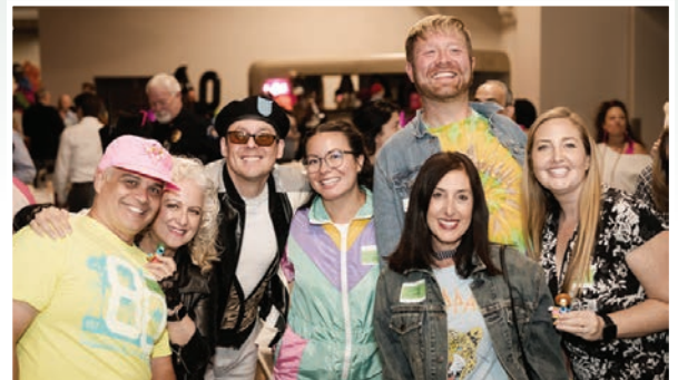
Members of the current class of 2025