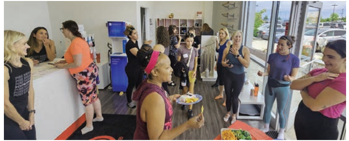
Attendees enjoyed light bites and beverages after learning more about Pure Barre