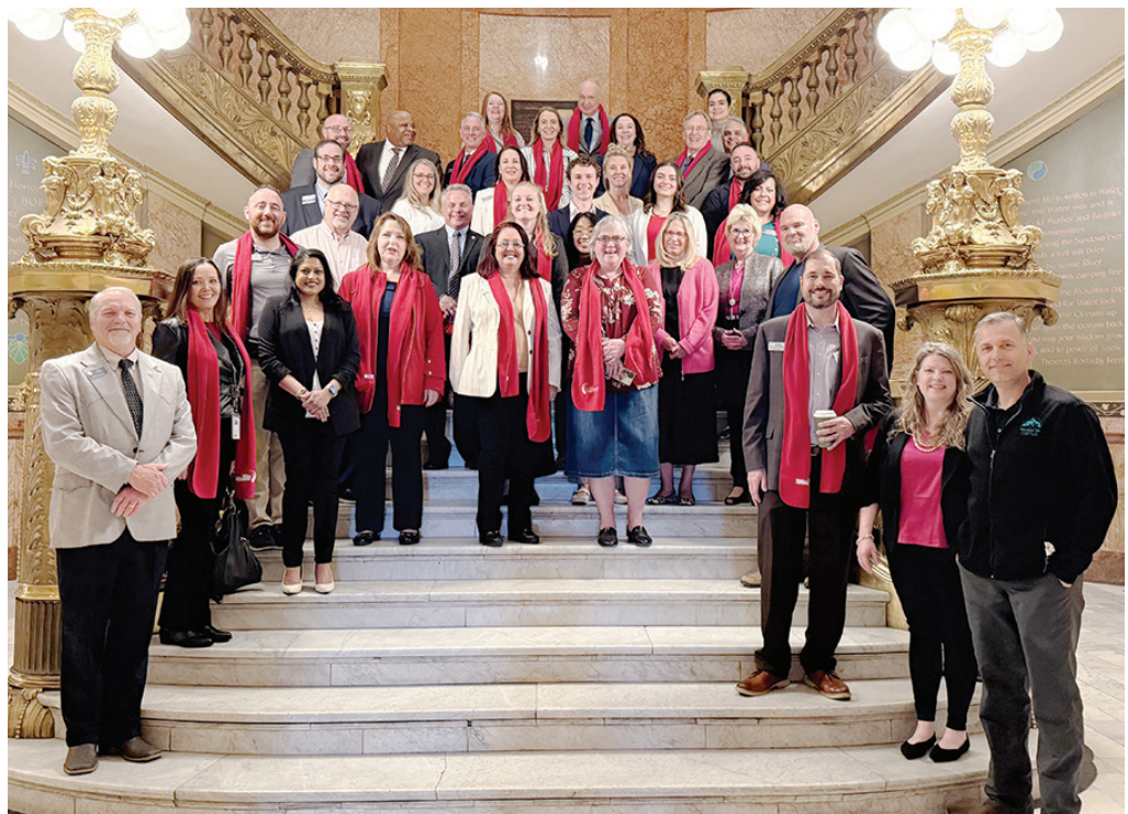
Chamber members gathered on the steps leading into the foyer - many wearing the red scarves provided by The Chamber.

On March 19, Women in Business hosted a headshot session and networking event to help attendees refresh their professional