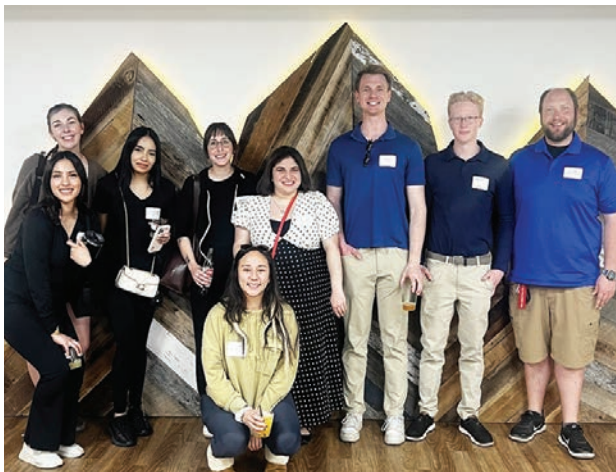
Young Professionals at the Stanley Marketplace.

Participants explored how to incorporate yoga principles into career development and daily work routines to create a more mindful and harmonious workplace. Whether they were seasoned yogis or brand new to the practice, everyone walked away with valuable tools to enhance focus, balance, and well-being in the professional world. They also were treated to a refreshing beer at Cheluna.