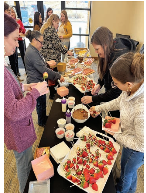
Creativity and delicious treats at the February Women in Business gathering.