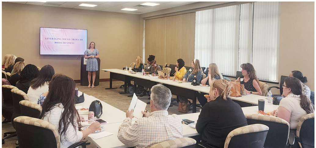
It was a full house at the April 16 Women in Business meeting about Leveraging social media.