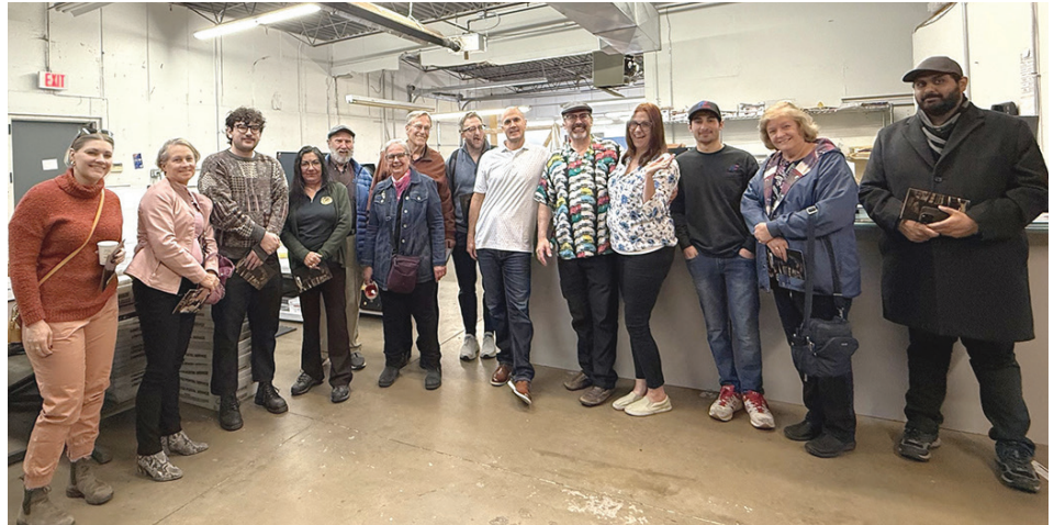
Chamber members learned about the many tools used in the printing industry.