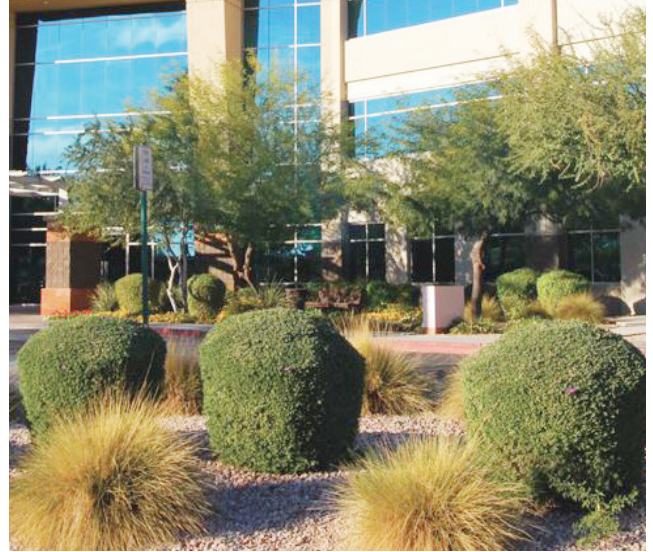
An example of water-wise landscapes through Aurora Water's Grass Replacement Incentive Program (GRIP).

See additional programs and resources, including irrigation and toilet rebates at Auroragov.org/Conservation . ■