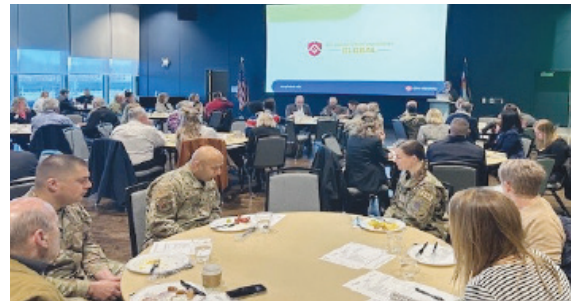
Defense Council members receive an overview of Colorado State University Global at the CSU Spur.

The April 10, 2024, Young Professionals' tour of the Cherry Creek Innovation Campus was cancelled and will be rescheduled.