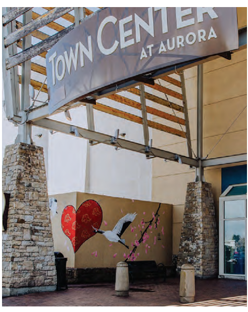
Artwork at one of the entrances to Town Center at Aurora.

welcoming, interesting, and community friendly place to shop and gather.