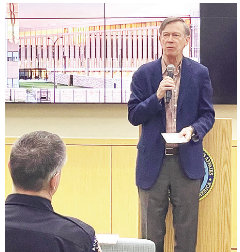
U.S. Senator John Hickenlooper

The council was also treated to a special guest, U.S. Senator John Hickenlooper. The Senator expressed his appreciation to The Chamber and Defense Council for helping to ensure that U.S. Space Command remained in Colorado. He also talked about the importance of supporting the military and veterans and keeping Colorado a great place for them to serve and live. The Senator shook hands with members after the meeting. ■