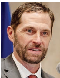
U.S. Representative Jason Crow