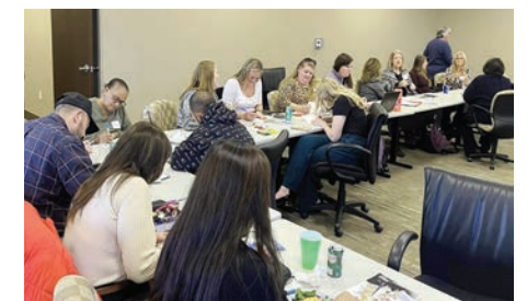
It was a full house at the November "Operation Holiday Cheer" WIB gathering that generated more than 300 cards and gifts for service members at ISA Bahrain Navy Base.