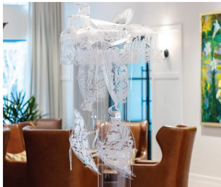
Saddle sculpture by Maeve Eichelberger.