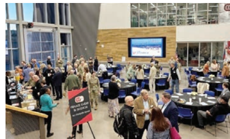
October 2024 Council meeting at Cherry Creek Innovation Campus.