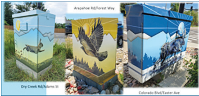
Examples of the City of Centennial's Department of Public Works collaborations with the City's Arts and Cultural Foundation.

The recently completed Arapahoe Rd bridge over Big Dry Creek features stunning Colorado scenes viewable from the trail and the city had added a new "branding" monument on Yosemite St just south of Arapahoe Rd. Another successful program is the " wrapping of traffic signal cabinets " throughout the city, transforming the drab cabinets with scenes of nature and bright graphics.