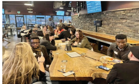
Speed Networking at Dry Dock Brewing.

Tasty bites from Legends of Aurora Sports Grill and drinks were generously sponsored by Community College of Aurora .