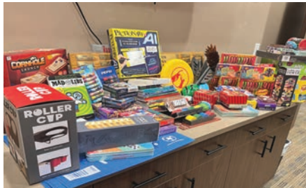
Generous donations from members allowed Chamber staff to purchase games and treats to be included in the packages.

..... Women in Business did not meet in December 2024.