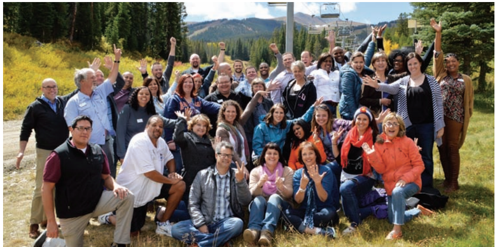
2015/2016 Leadership Aurora Class in Breckenridge.

The first night's reception started with a "Claim to Fame" game, allowing class members to learn more about each other as they guessed who each "Fame" belonged to. Little did we know that we have such a diverse and "famous" class! We ended the evening in a bit of frenzy as there was a cable outage in the area, and the Broncos game was on. We experienced our first challenge as a class, pulled it together, and managed to hike downtown to find Breckenridge Brewery where we watched the Broncos barely make their victory!