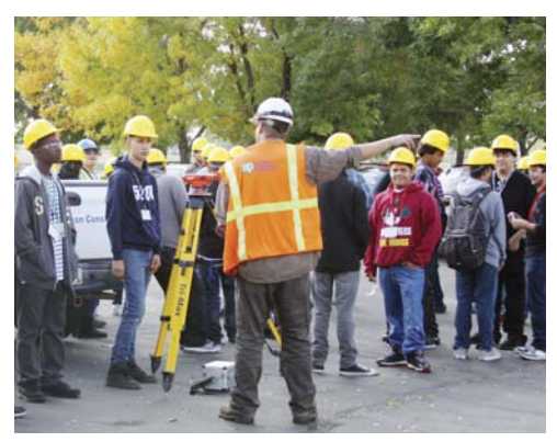
Adolfson & Peterson Construction volunteers offer activities and demonstrations during the 10th Annual Colorado Construction Career Days.

Industry volunteers used various hands-on activities, equipment and materials to demonstrate to nearly 2,000 high school students grades 10 through 12 the unique aspects of today's construction world.