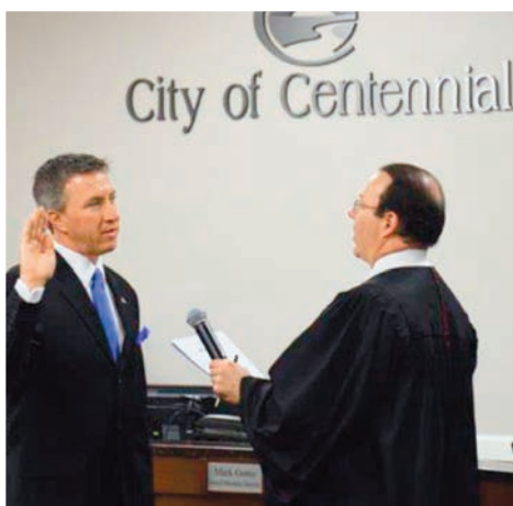
CJ Whelan sworn in as Mayor Pro Tem for the City of Centennial.