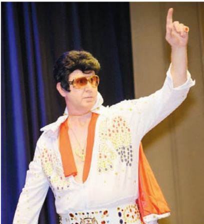
Elvis was – of course – his usual charming self, and acknowledged the cheering crowd.