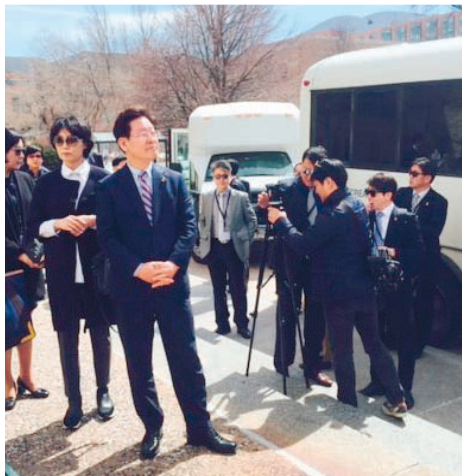
Aurora Sister Cities International tours a number of Aurora and Denver landmarks.