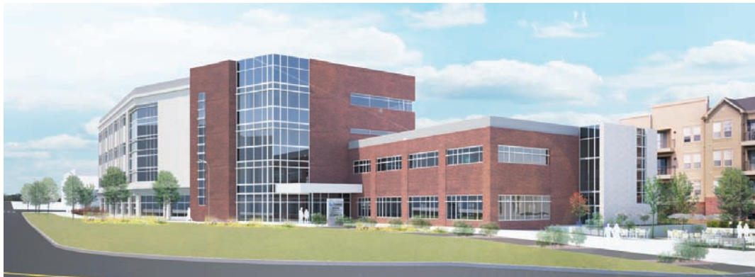
Rendering of Bioscience 2

A new venture next to the Anschutz Medical Campus combines research, business and education - all under one roof.