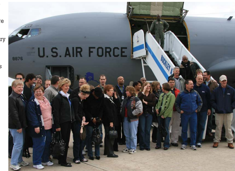
Leadership Aurora class prepares to board a KC-135 airplane at Buckley AFB.

We discovered that our own Barbara Atwell would be the expert tour guide for our Windshield Tour and site visits of the Buckley Chapel, Dormitories, and Health Complex. The Chapel works hard to serve service men and women from all faiths. The Dormitories were newly built and featured a very cool perk that class member Daryl Guill was principal in coordinating — a state of the art mini-movie theater with comfy seats and rich surround sound. The Health Complex was truly state of the art, as well, and included updated weights