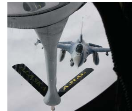
Class members watch a midair refueling of an F-16.

After a light and delicious lunch we felt the need for speed. We would soon be air-borne for the most experiential and exciting component of the day that being a sortie in a KC-135 airplane providing a training mission for our learning that allowed us to be there and watch the elegant midair ballet of an F-16 refueling procedure. We were enthusiastic and maybe a little anxious as we all donned our oxygen bags, strapped into the red canvas harnesses, and roared from the runway. We experienced another memory moment as we watched the precision flying of the pilots and crew from the vantage point of lying on our bellies, in the rear of the plane, next to the boom officer who guided the 40 foot long fuel line to the fighter jet below.