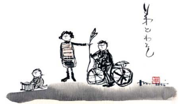
artist © Mami Yamamoto-Finke

Updates will go up as the film schedule takes shape - - so visit often at www.auroraasian.org or call (303) 326-8695.