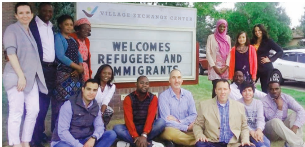
The Village Exchange Center (VEC), founded in 2017, is a non-profit organization formed to serve immigrants and refugees in the Aurora/Denver metro area. As a collaborative community center and multi-faith worship space in Original Aurora, the VEC support integration, engagement, and empowerment of newly-arrived and hosting communities through organic and co-located programs, informational services, and cultural activities.

OIIA was recognized by the National League of Cities for promoting cultural diversity in Aurora through its City Cultural Diversity Awards in 2017.