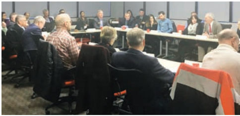
Transportation committee members listened with great interest to the Feb. 6 presentation about ARTA and AACMD.