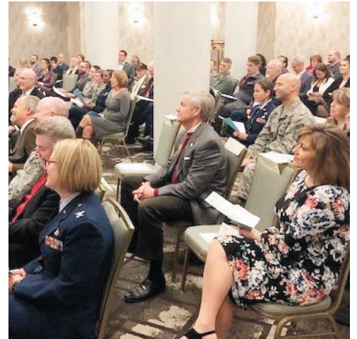
Members of the Aurora Chamber Defense Council listen to Allied Commonwealth Partners from Australia, Canada, and the United Kingdom, who talked about their experiences and challenges while living in the U.S.

Topics discussed included the support received from the Aurora community; challenges encountered finding housing, insurance, and transportation; and how the community can better assist military members and their families. It was an enlightening discussion with many defense council members offering assistance to mitigate some of the challenges these Allied Commonwealth Partners face during their transition and assignments at Buckley AFB. ■