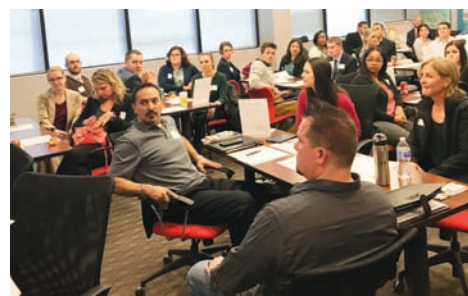
Speed networking at its best at the January 24 Young Professionals meeting.

Omada 7, formerly known as Extreme Relationship Management, hosted the event and offered participants step-by-step directions on how to accelerate business contacts by gathering in intimate groups of four, to share personal backgrounds and business goals. The session gave participants the opportunity to perfect their elevator speech, and to determine what information is necessary in a business conversation.