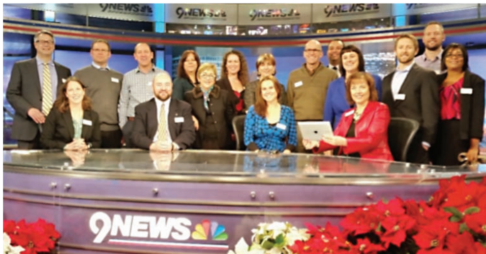
Members of the LA class at 9NEWS, posing as a large 'anchor group' on Media Day.

The Leadership group then visited four of the many Career and Technical Education (CTE) classes offered, including; Automotive, Design, Culinary, and DECA (a Business Marketing program) witnessing first-hand how students apply what they're learning to real world problems.