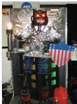
Just a little something created by students in a CTE class!

(Excerpted from the Education Day article, by Catherine Trough, Community College of Aurora)