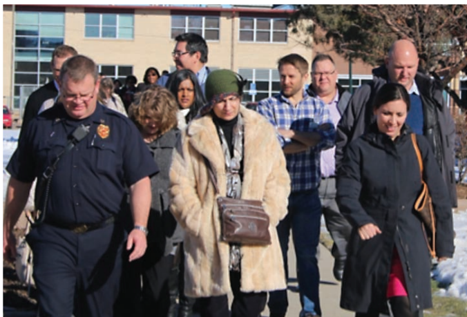
LA Class members walk to the Colorado Film School on the CCA Lowry Campus during Education Day.

The day began at Smoky Hill High School with an overview of the evolution of secondary education in the Cherry Creek School District.