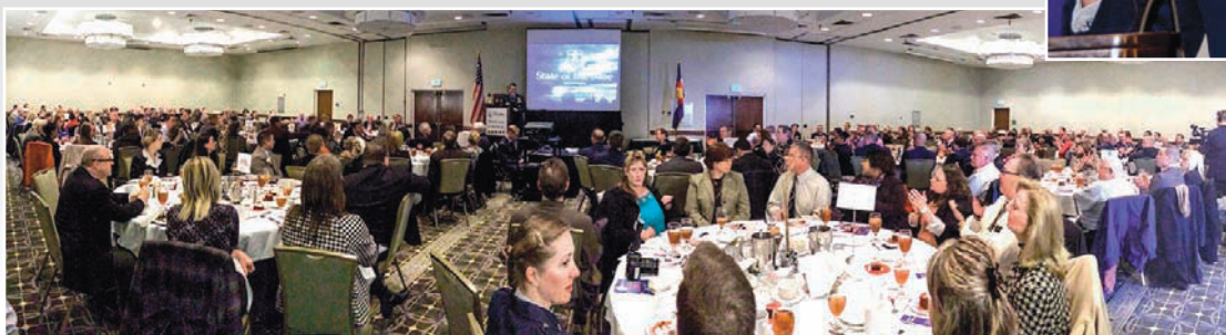
The audience at the annual State of the Base event represents a cross section of business, military, professional and political leaders from across the Eastern Metro area. (USAF Photo courtesy 460th Space Wing Public Affairs)

Colonel Wagner told an overflow crowd that Buckley continues to be one of the most dynamic military installations in the country with a critical space mission vital to the country's defense. (USAF Photo courtesy 460th Space Wing Public Affairs)