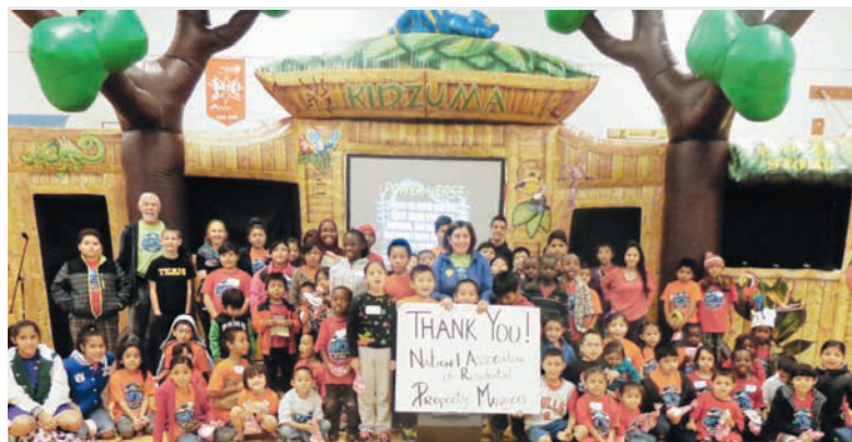
Highpoint@Colfax kids pose for a picture thanking the Denver Chapter of the National Association of Residential Property Managers.

Good things happen when organizations are connected through The Chamber! ■