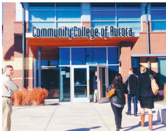
Class members enter the Community College of Aurora Lowry Campus West Quad building for the afternoon session of Education Day in January 2015.