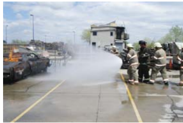
Fire Day Session