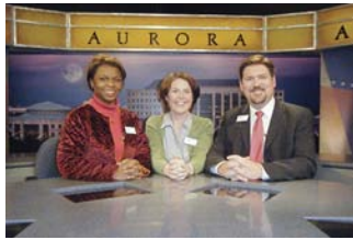
Media Day Session