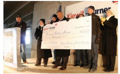
Kiewit-Turner presents the Denver Fisher House with a donation at Wednesday's Veteran Recognition Lunch at the Replacement Medical Facility.

Kiewit-Turner recently donated $20,000 to the Denver Fisher House Foundation as part of their commitment to supporting and promoting quality care for veterans. The donation was announced as part of Kiewit's annual Veteran Recognition Lunch, which included the participation of more than 150 local veterans, and 1,600 employees and guests.