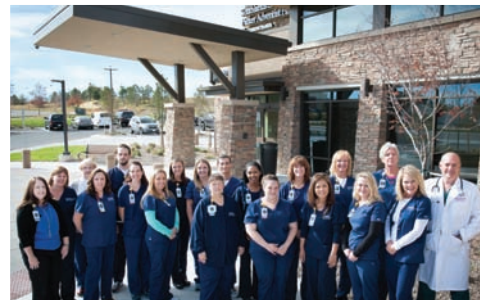
Southlands ER medical team.

For more information about the Parker Adventist Hospital freestanding ER and the Neighborhood Health Center visit www.parkerhospital.org/er and www.parkerhospital.org/southlands .