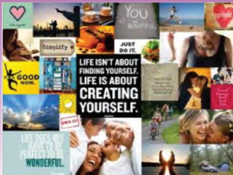
Sample vision board: Cut and paste things onto your vision board that you want to see in your own life.