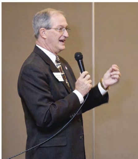
Aurora Mayor Steve Hogan

A copy of the full text of Mayor Hogan's presentation is available on the Aurora Chamber of Commerce web site and recorded excerpts are also available on YouTube.