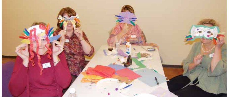
Leadership Aurora class members make masks for children at the Aurora YMCA during October's Community Day session.

The organizations included the Aurora Housing Authority , Lowry Family Center, Providers' Resource Clearinghouse , Arapahoe/Douglas Works! , Arc of Aurora, Boys & Girls Club, Mile High Council at Fitzsimons, AuMHC -Aurora Youth Options, Interfaith Task Force, CASA Advocates for Children, Friends of St. Andrew, Self Improvement Opportunities, DAVA (Downtown Aurora Visual Arts), and Morning Star Adult Day Care Program.