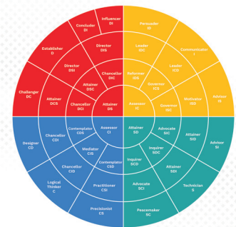
© 2024, The Institute for Maxwell Living, Inc. | Personality © MAXWELL LEARNING

Get the most out of your results with individual or group training with our certified coach, who can help unlock your potential and succeed in every facet of life.