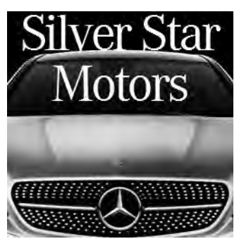
Silver Star Motors