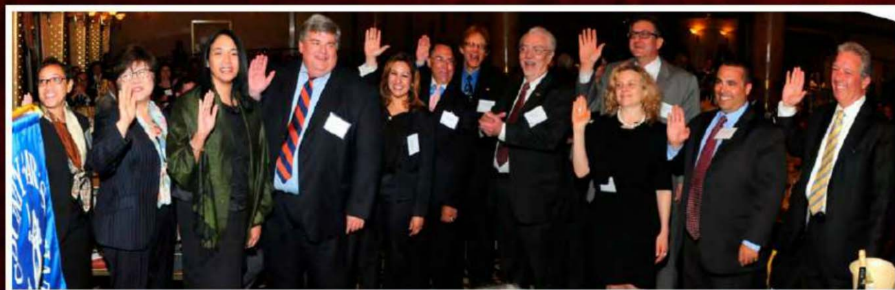
Members of the Board being sworn in.