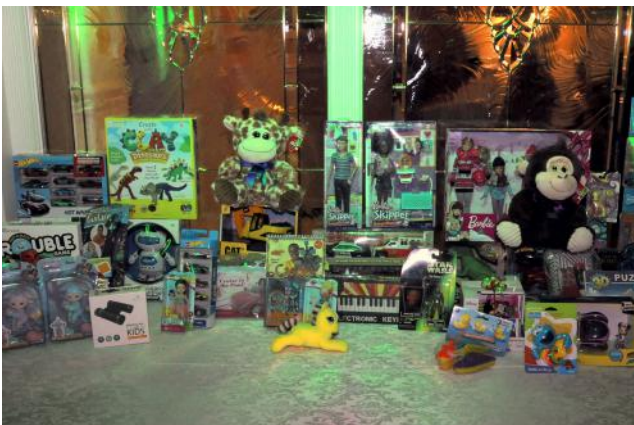
Toys collected for Forestdale, Inc., a foster care agency.