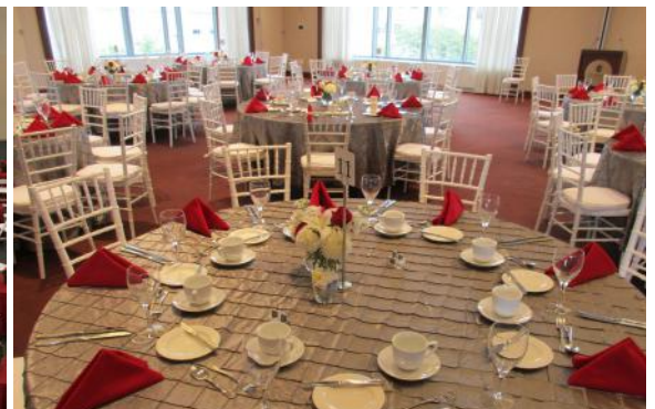
D'Angelo Center Ballroom