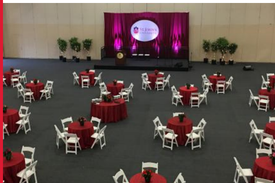
Taffner Field House

"Modern Spaces, Easy Parking, Attentive, Caring Hosts"