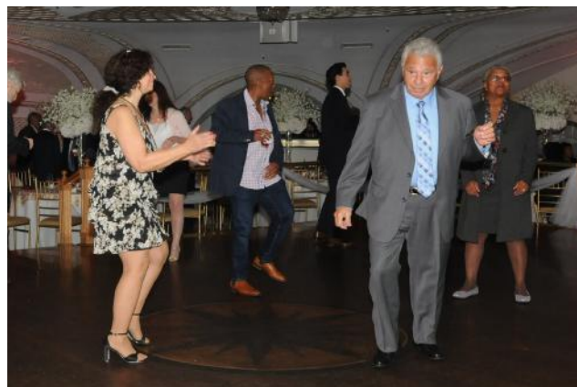
Attendees getting down on the dance floor.