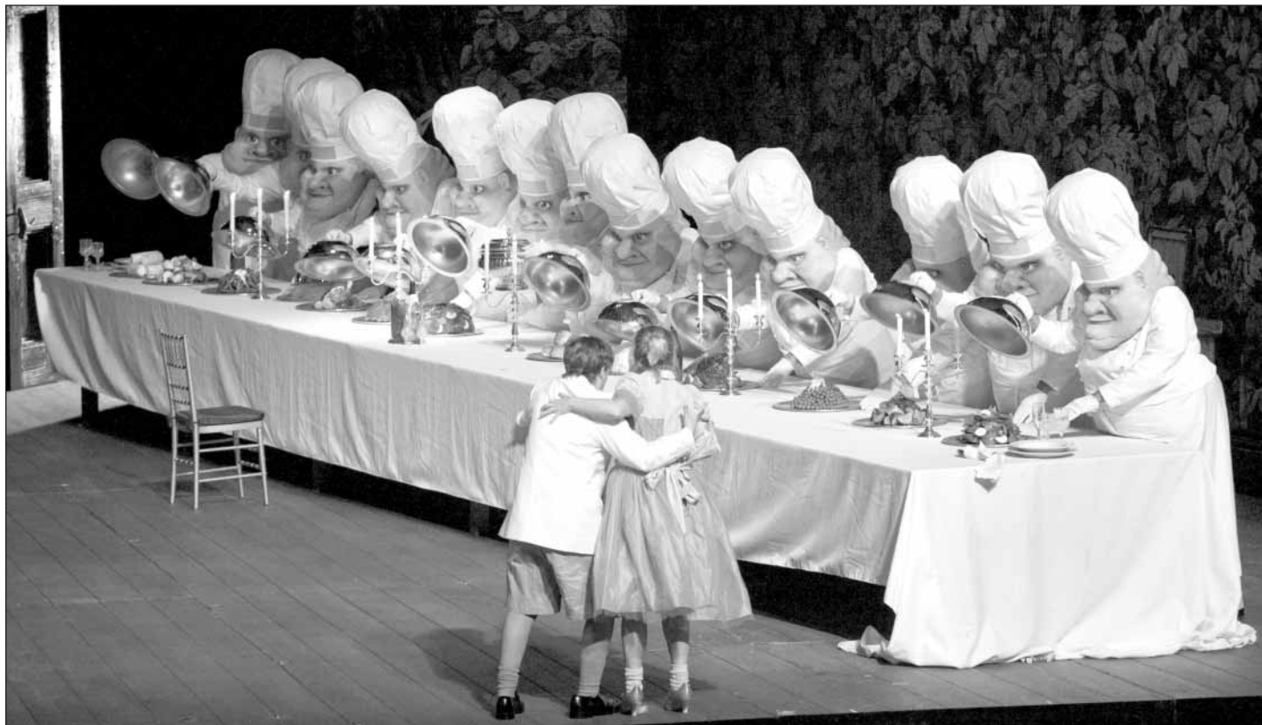
Met Opera Production of Hansel und Gretel

Continued From Page 13 — sing the roles of the parents. Maestro FABIO LUISI conducts all eight performances. Set the oven to SIZZLING for this delightful operatic classic!