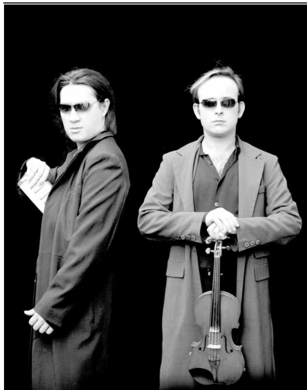
THE 92ND STREET Y PRESENTED THE NYC DEBUT OF IGUDESMAN & JOO