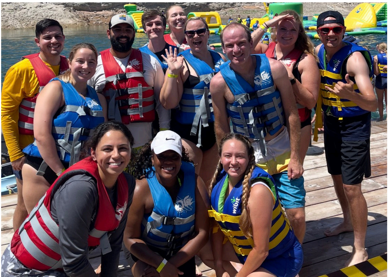
Young Professionals TEAM Meet-Up

Want to make the most of your membership? Join an APRA TEAM! You can join a team in the Members Hub. See below or visit our website for more information on each team and committee.