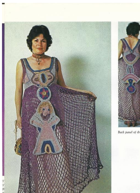
Back panel of dress

In her 1972 book, Del explains crochet as an artform: "The word art derives from Ars , coming from an Aryan root signifying join or put together. Crochet as art joins much more than stitches and yarn. Crochet lends itself in a unique way to the joining of accumulated techniques, viewpoints, and experience. The range of